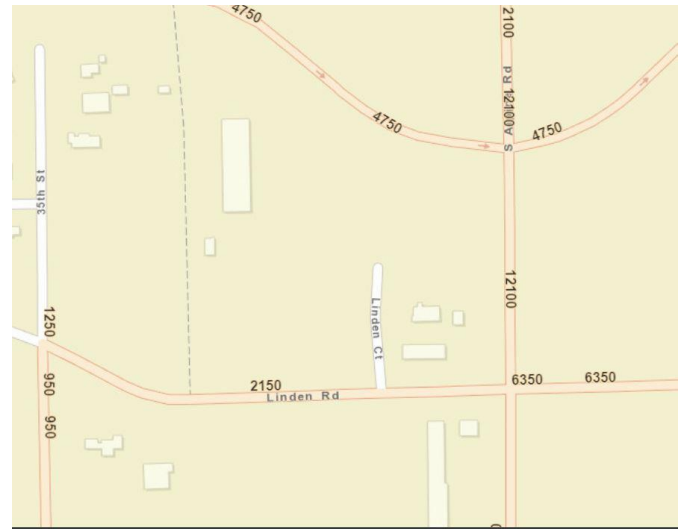
IDOT Traffic Map

Approximately 12,100 vehicles per day on Alpine Road.