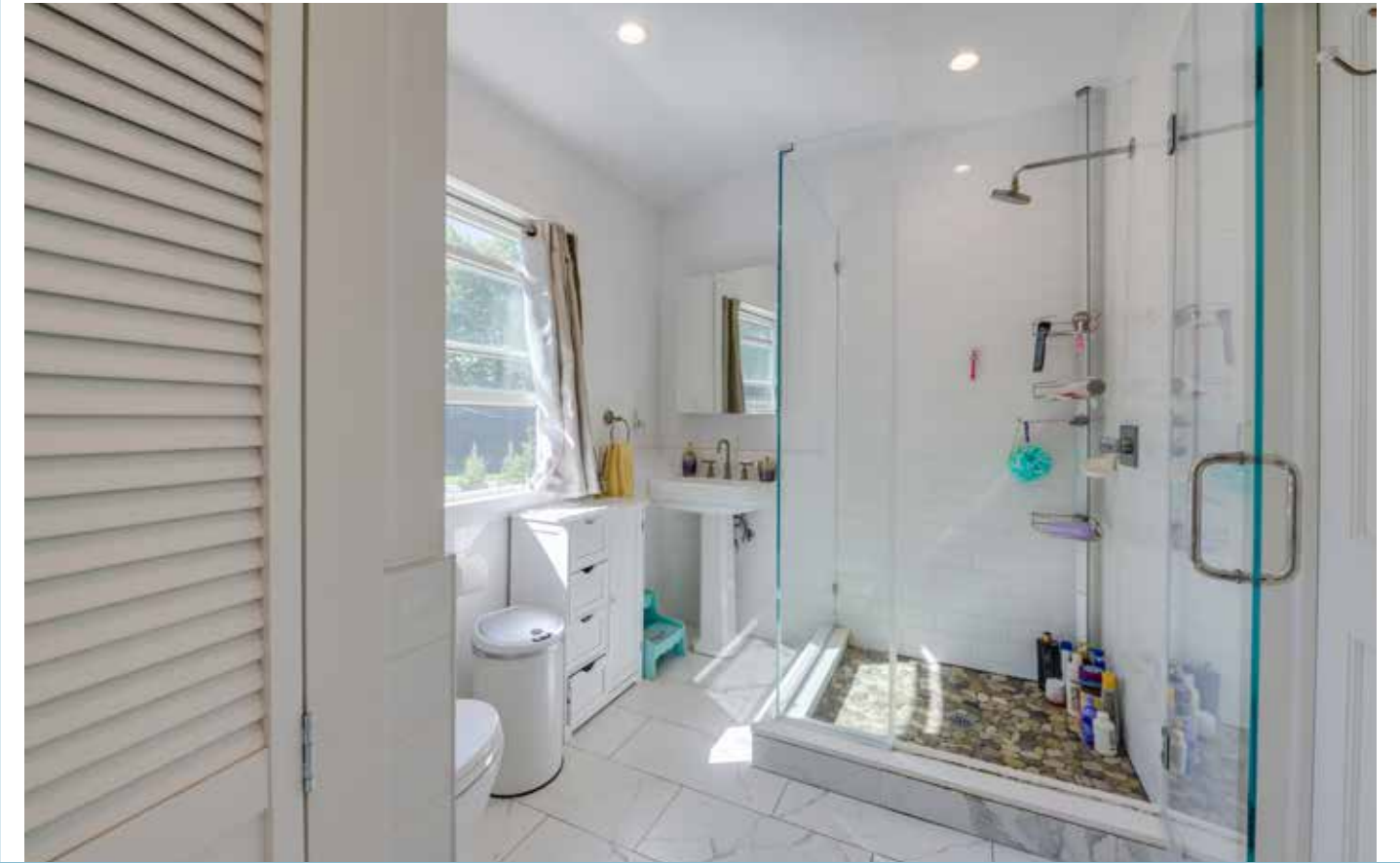
BATHROOM EXTERIOR APARTMENT/GARAGE