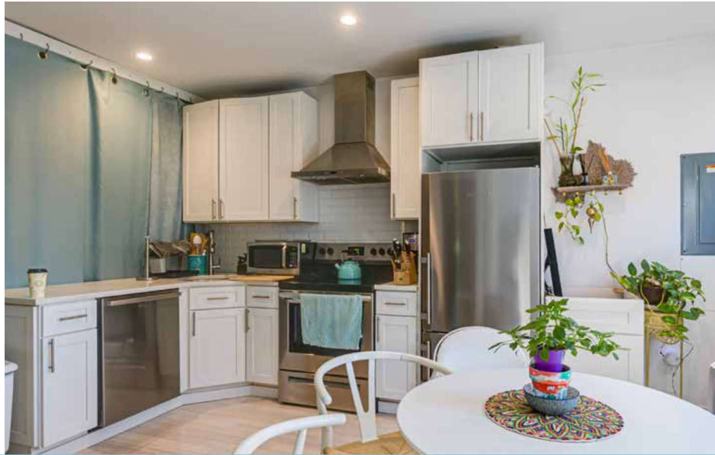
APARTMENT KITCHEN AND BEDROOM