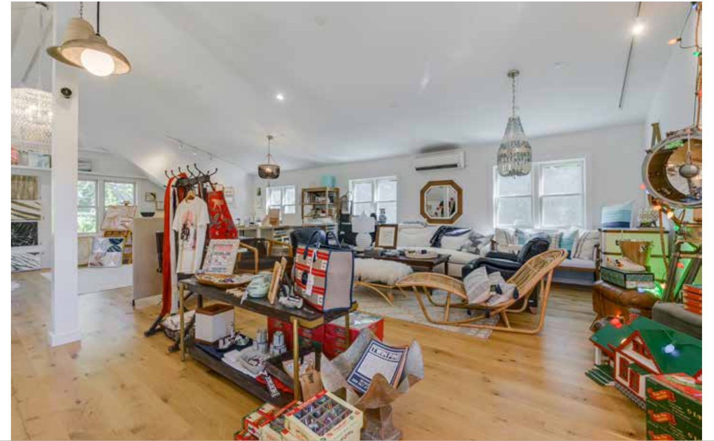
MAIN BUILDING INTERIORS