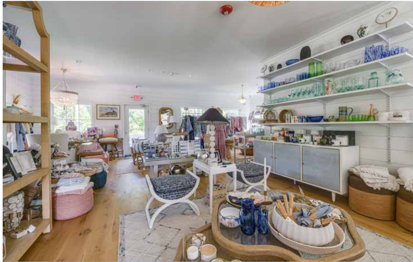
MAIN BUILDING INTERIORS