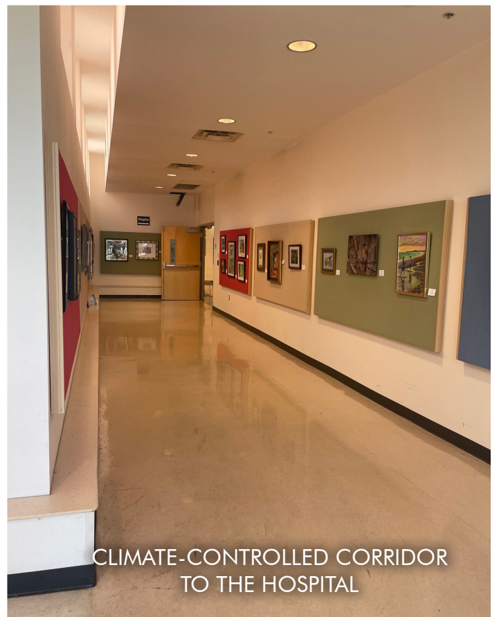
CLIMATE-CONTROLLED CORRIDOR TO THE HOSPITAL