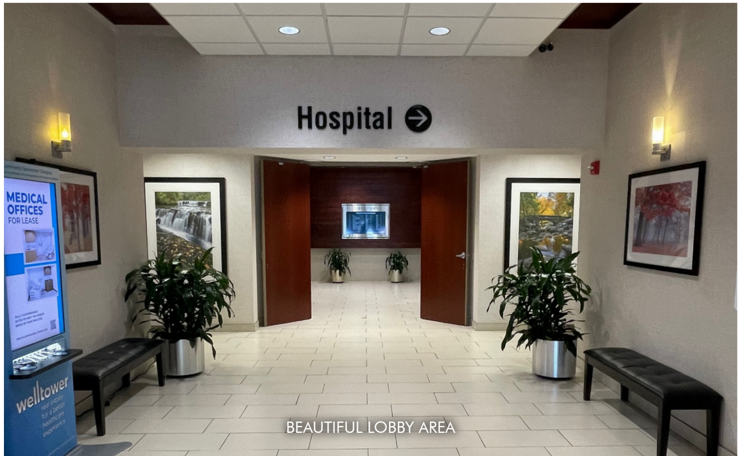
BEAUTIFUL LOBBY AREA