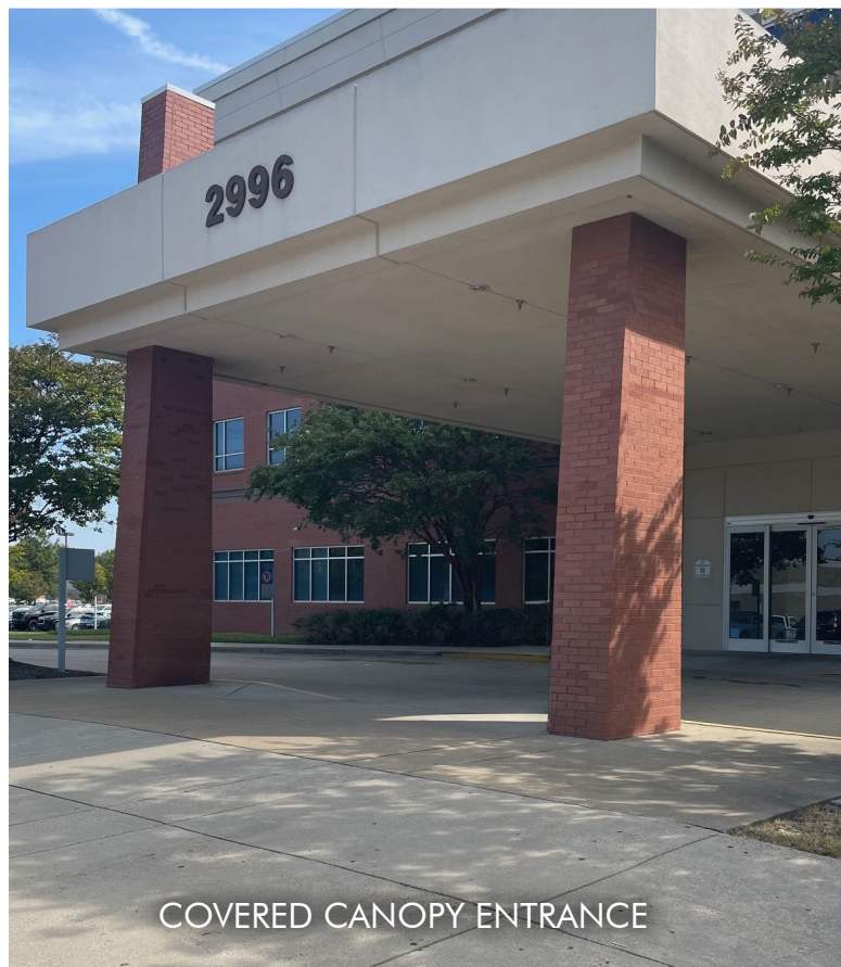
COVERED CANOPY ENTRANCE