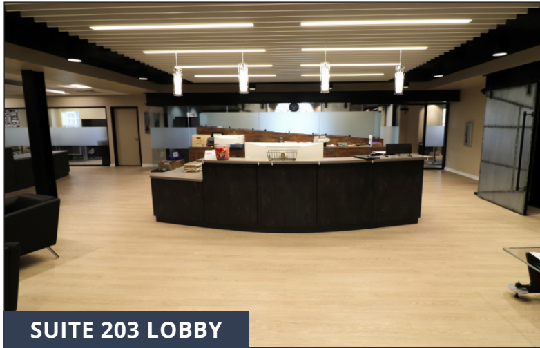
SUITE 203 LOBBY