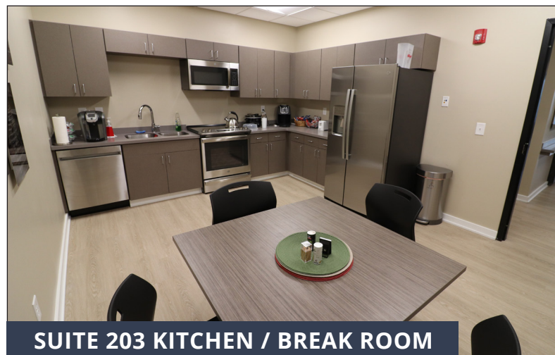
SUITE 203 KITCHEN / BREAK ROOM