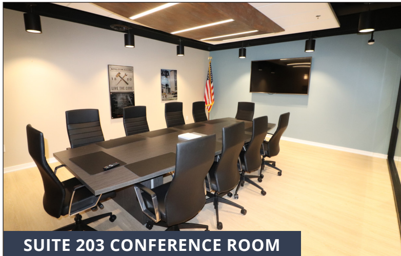
SUITE 203 CONFERENCE ROOM