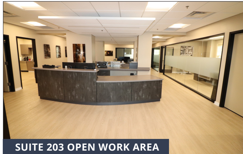
SUITE 203 OPEN WORK AREA