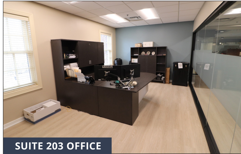
SUITE 203 OFFICE