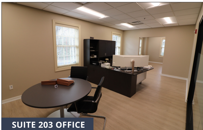
SUITE 203 OFFICE