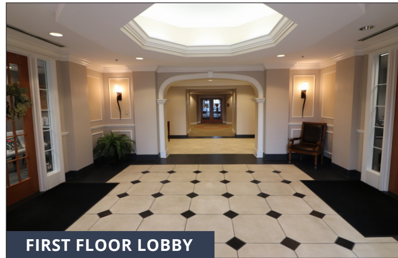
FIRST FLOOR LOBBY