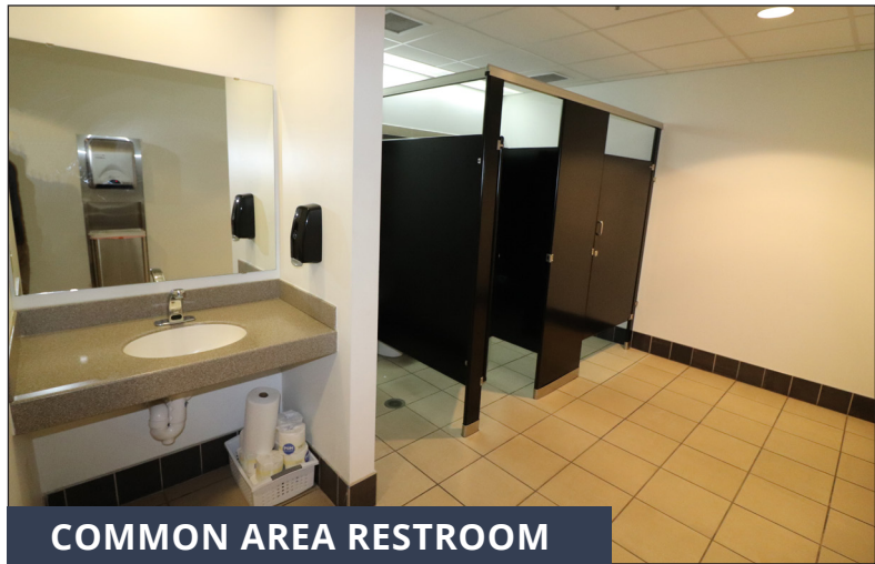
COMMON AREA RESTROOM