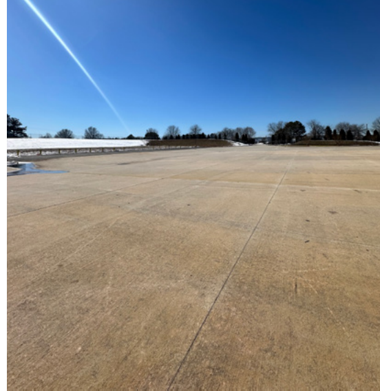
Large truck court and ample parking can be used for outdoor storage