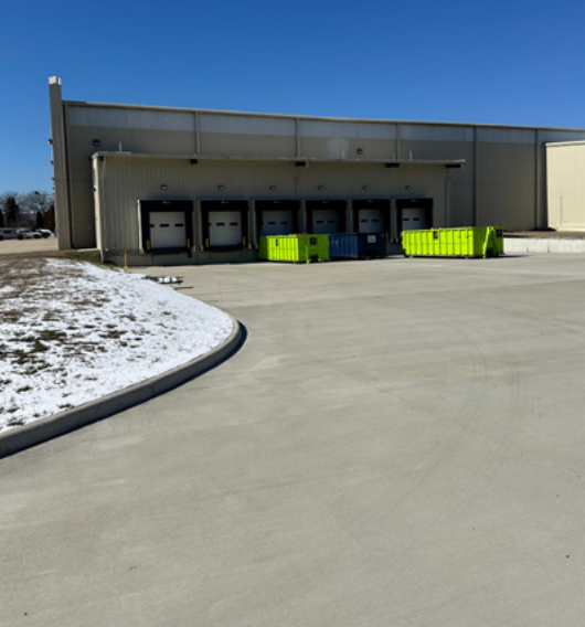
Six dock high doors