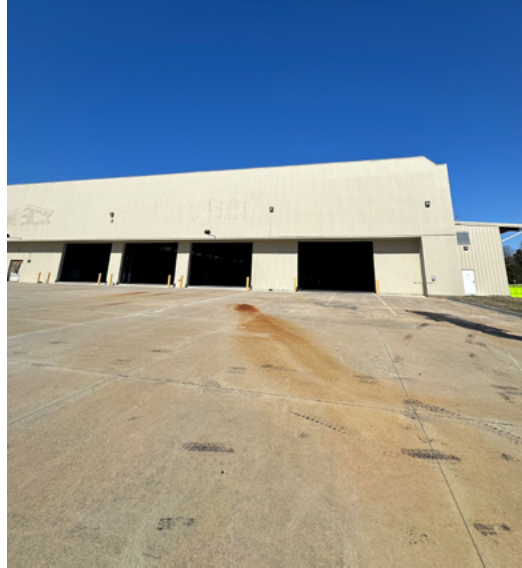
Five (16' x 24') grade level doors