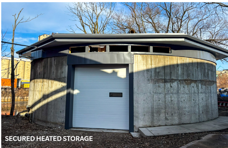
SECURED HEATED STORAGE