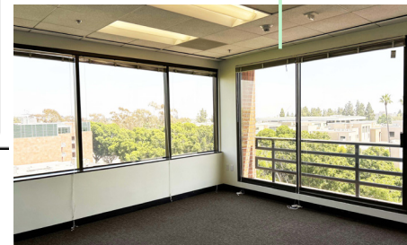
Sliding Glass Door