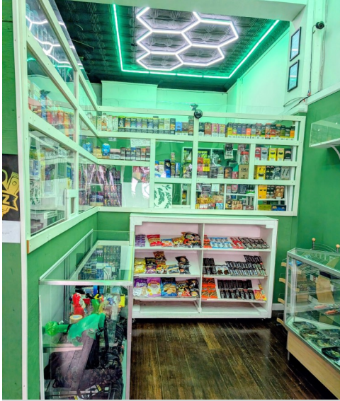
500 West Main St