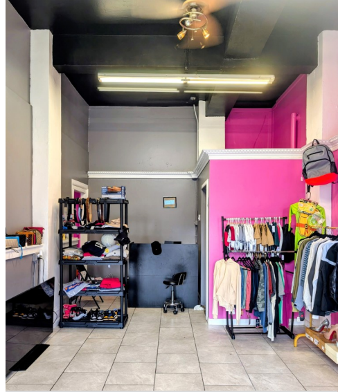
496 West Main St