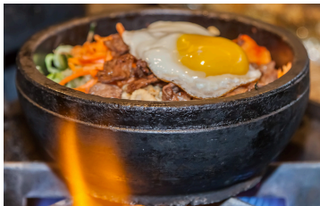
FULLY BUILT OUT KITCHEN