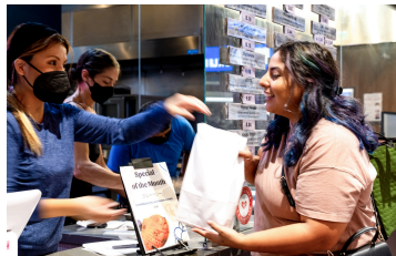
LOYAL CUSTOMER BASE