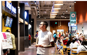
FOOD HALL ACCESS