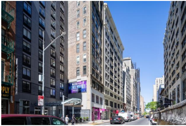
West 29 th Street (between 6 th & 7 th Aves)