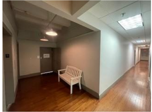
11 th Floor Lobby