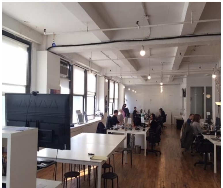
Open layout spaces

Berik Management is excited to bring to market the ENTIRE 11 TH FLOOR at 115 West 29 th Street, New York, NY 10001 .