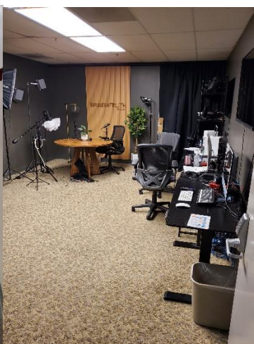
Studio AV Room

500 Seat Sanctuary, 7 Offices, 8 Classes, 133 Parking space, Prep Kitchen Basketball Gym, Bld. size 20,655 sq. ft. Lot size 1.78 Acres, zoning R-1-7