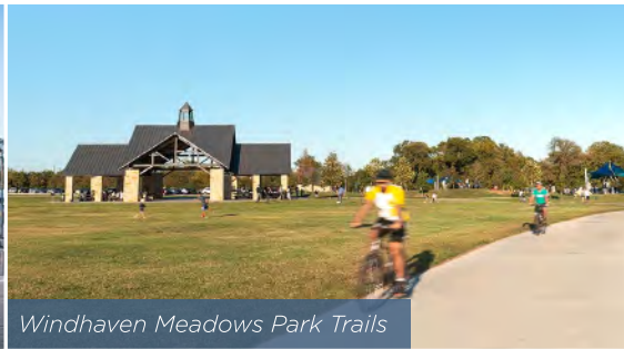
Windhaven Meadows Park Trails