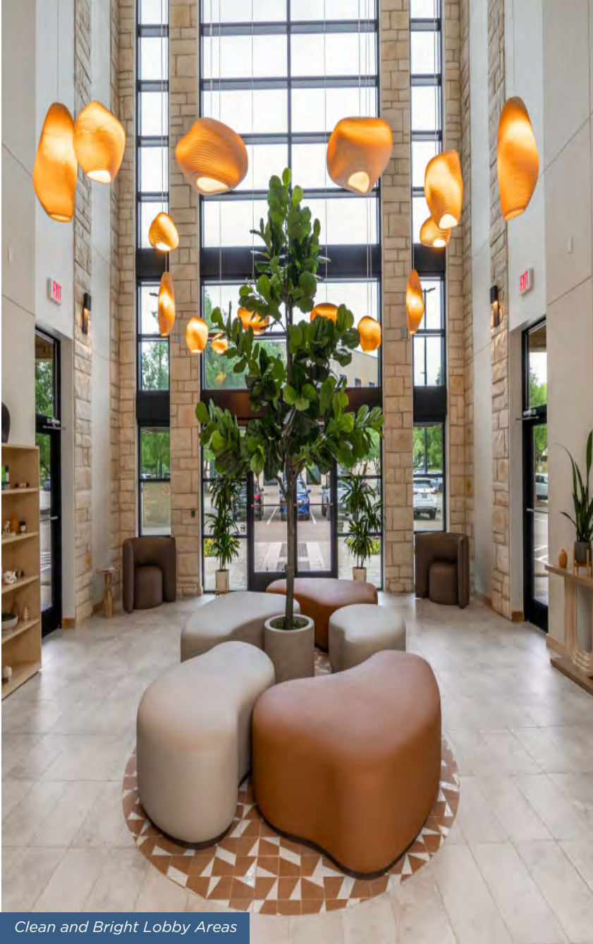
Clean and Bright Lobby Areas