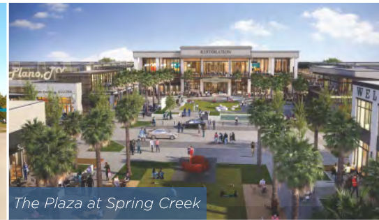
The Plaza at Spring Creek