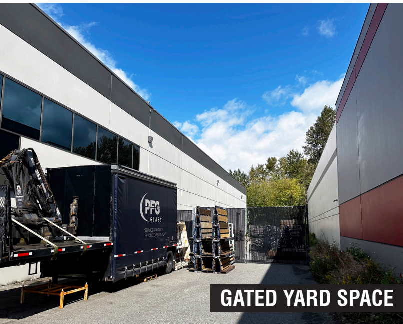
GATED YARD SPACE