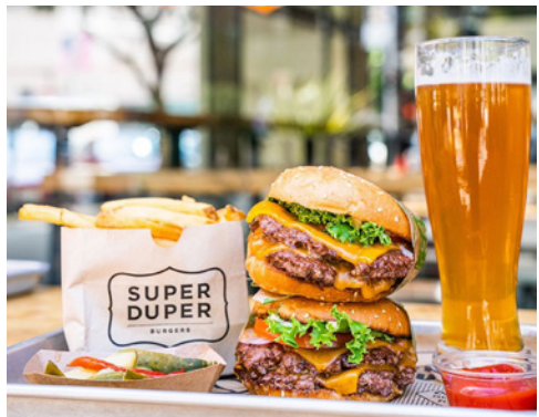
SUPER DUPER BURGERS