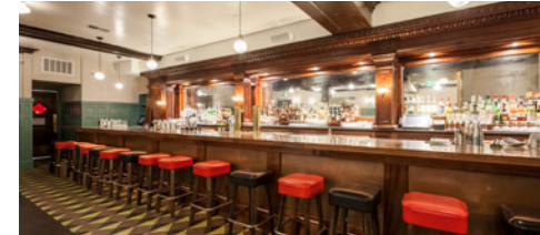
CAFE DU NORD