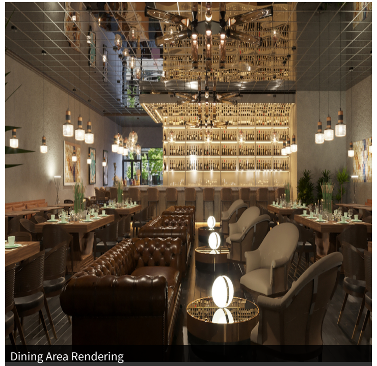
Dining Area Rendering

NICO PRISKOS 801.413.8902 nico@iproperties.com