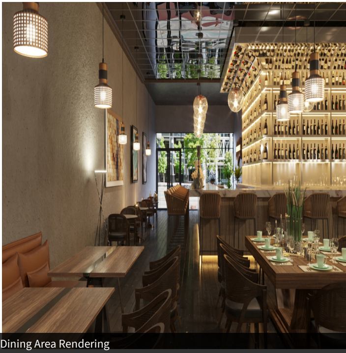
Dining Area Rendering