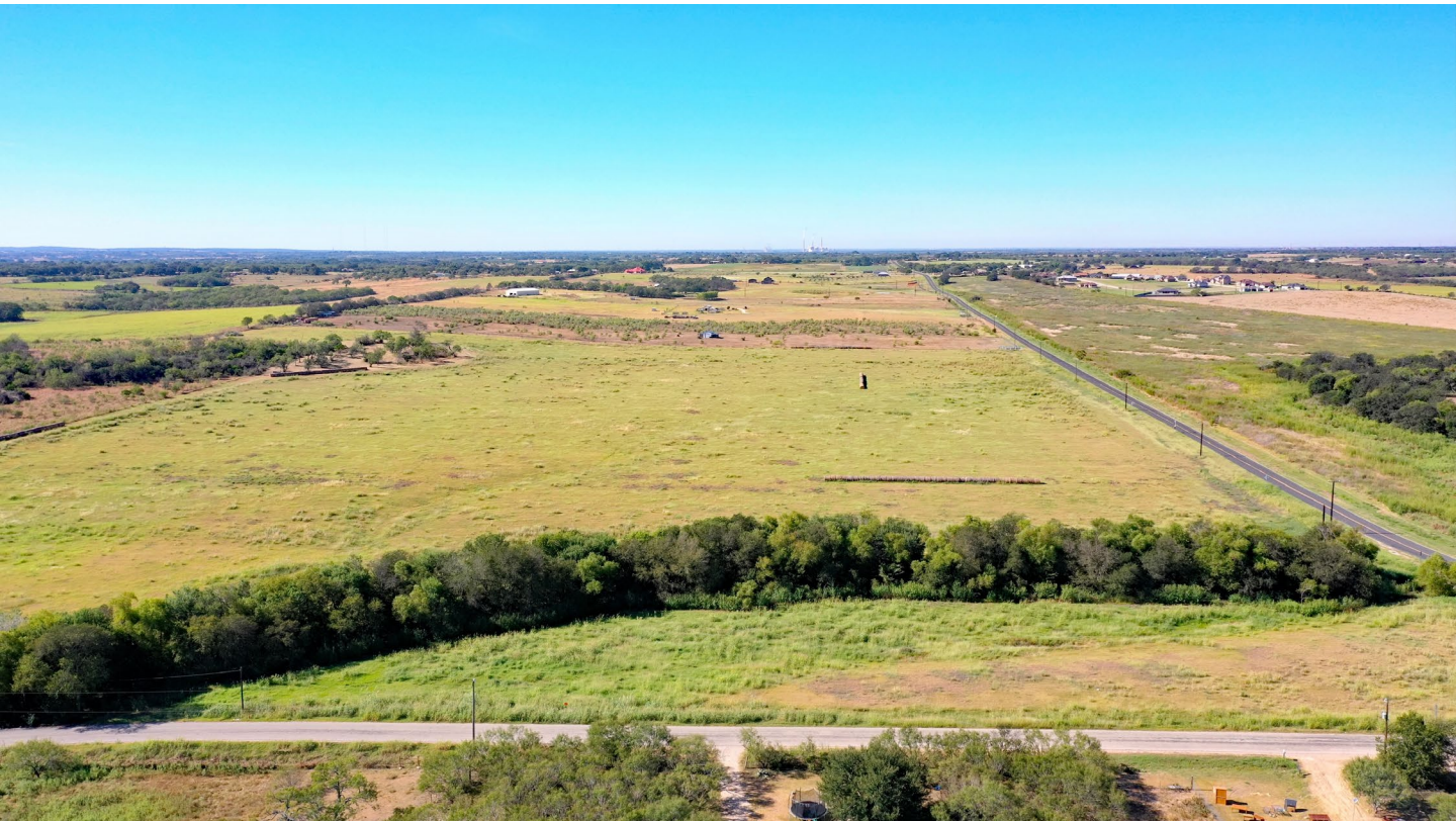
N Graytown Road