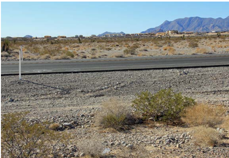
Looking south across Kyle Canyon Road towards SKYE CANYON, ±680 feet south of the site.