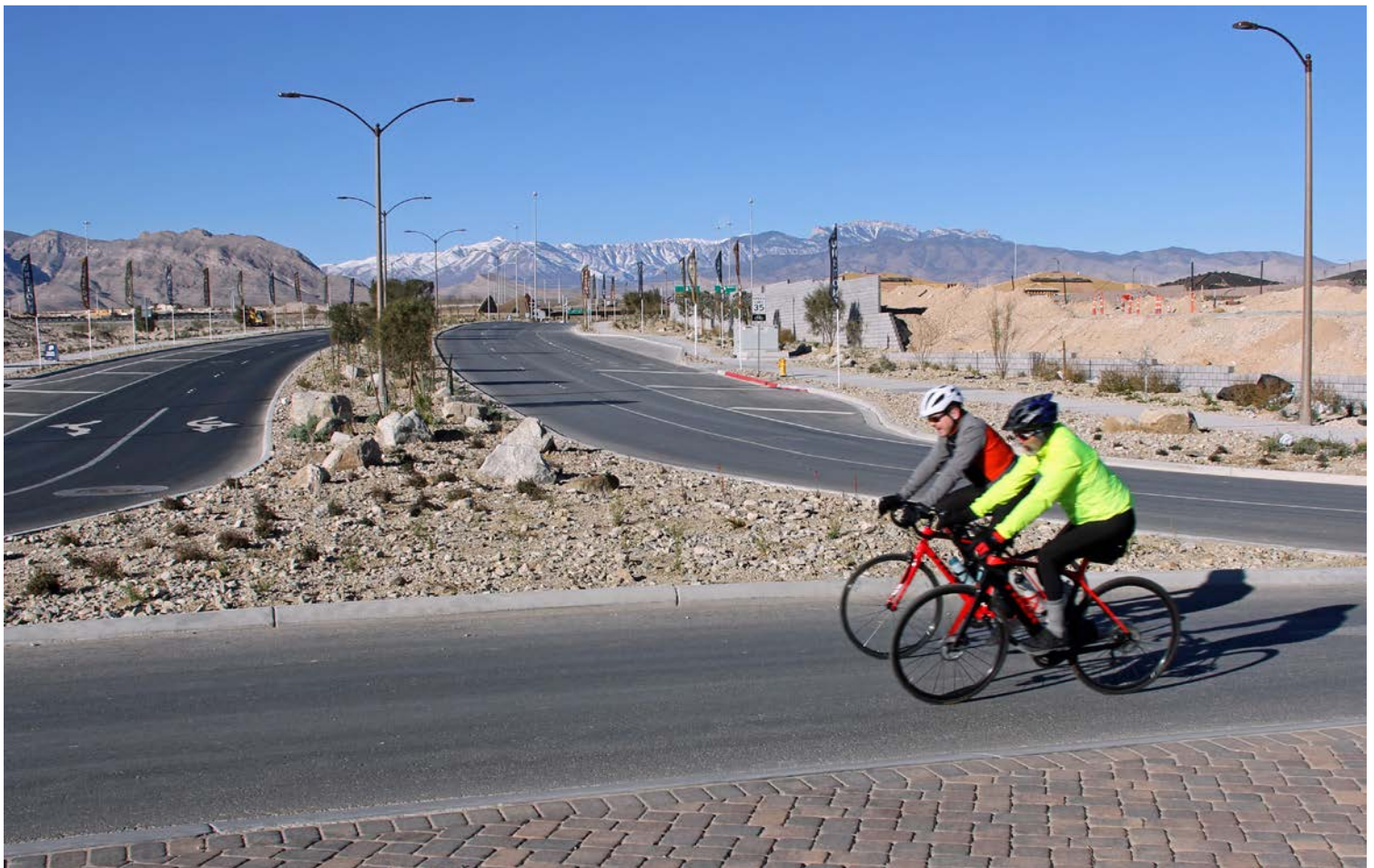
Looking west towards US-95 and Mt. Charleston from the east side of the Kyle Canyon interchange.