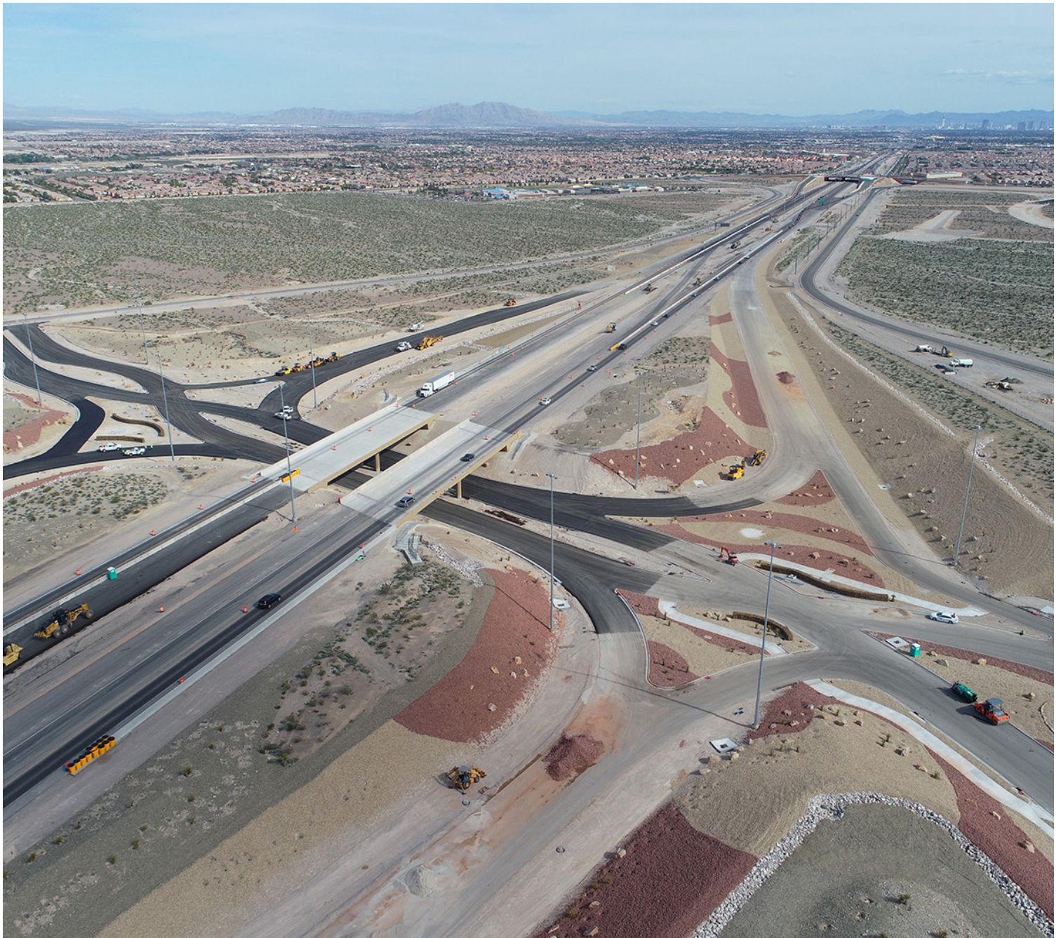
Image 1: Kyle Canyon Road & US-95 Interchange (Nevada Department of Transportation 2019)