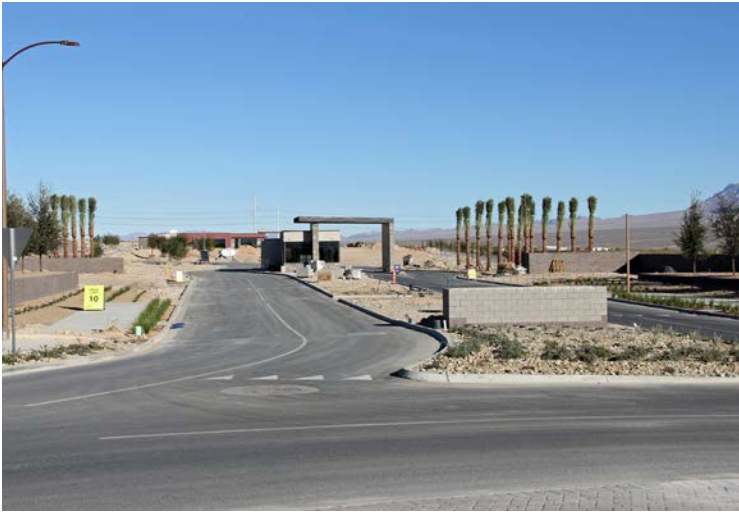
Entrance to Trilogy Resort Club by Shea Homes.