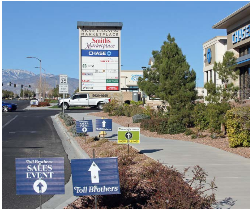
Nearby retail center.