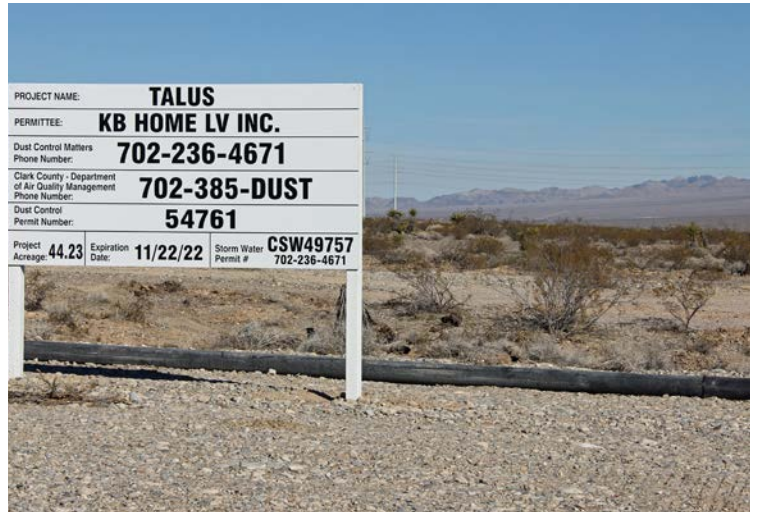
New neighborhoods breaking ground adjacent to the site.