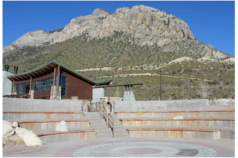
Spring Mountains Visitor Gateway, 17 miles west of the site.