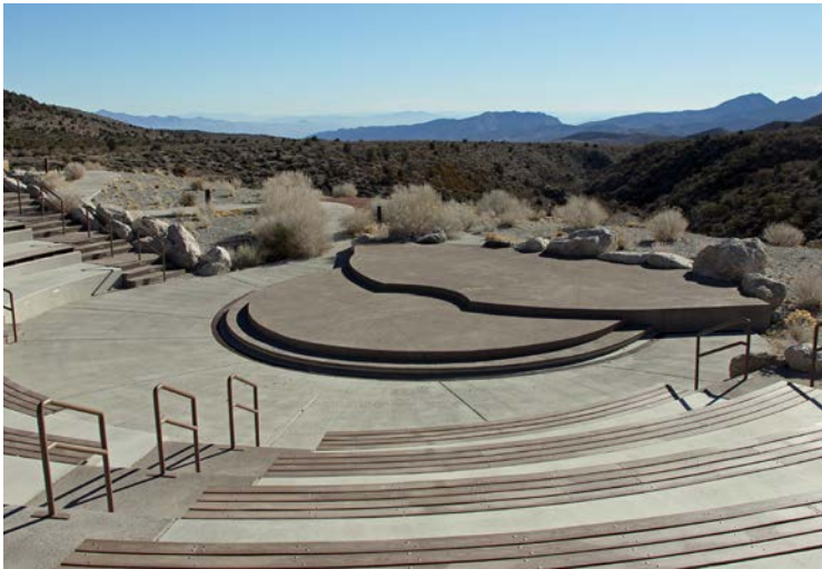
Spring Mountains Visitor Gateway, looking east towards Las Vegas.