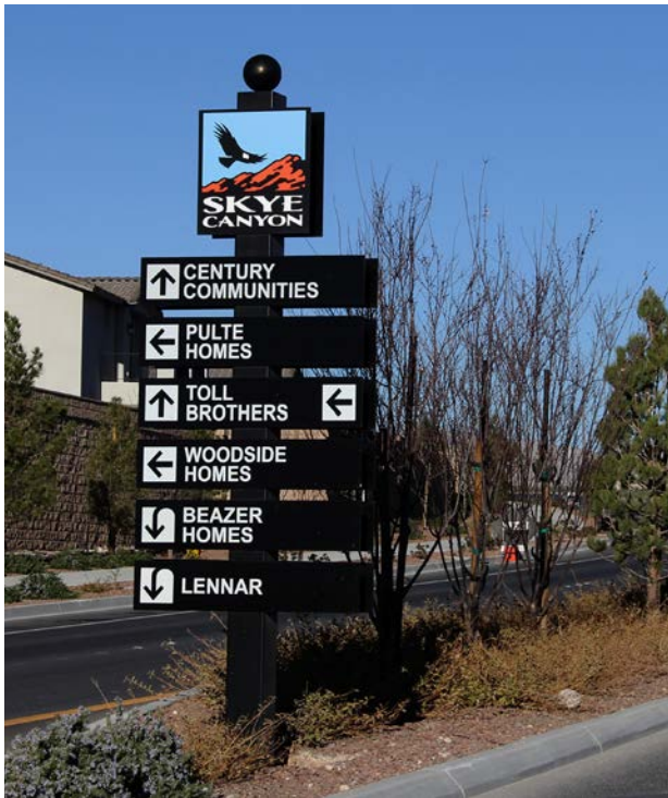
SKYE CANYON Homebuilder sign on Iron Mountain Rd., approx. 680 ft. S. of the site.