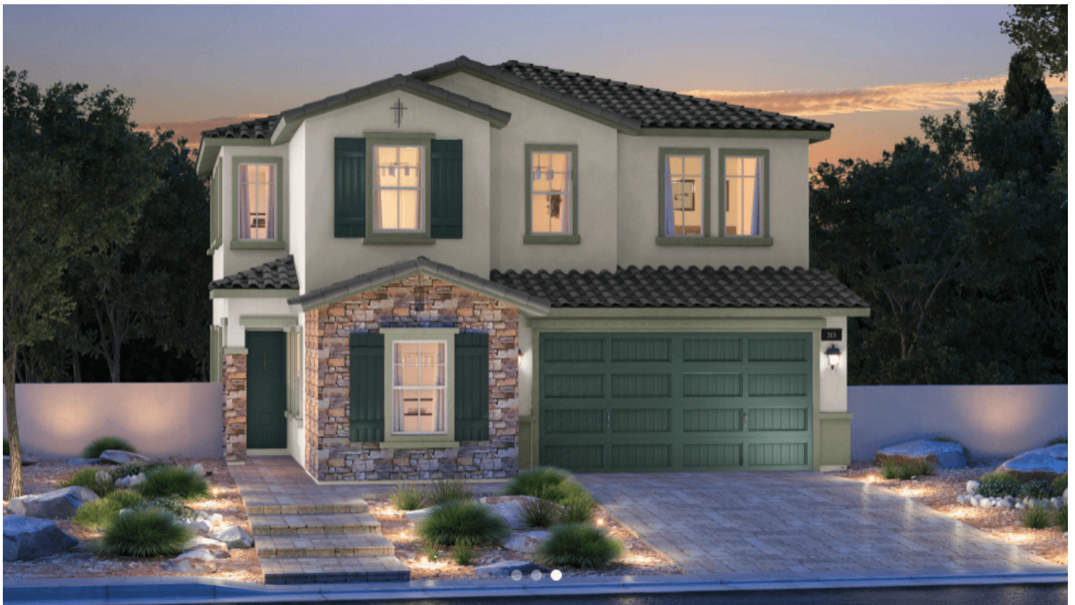
Typical Home Styles