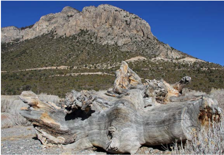
Spring Mountain Recreation Area.