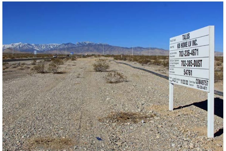
Looking west along Kyle Canyon Road, towards the Spring Mountains.