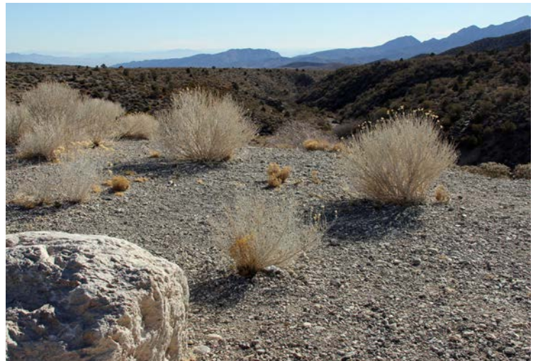
Looking east from Escarpment Trail towards Las Vegas.