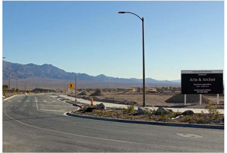
Looking east along Log Cabin Way in Sunstone towards the Sheep Mountains and Tule Springs Ranch.