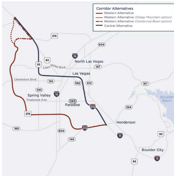
Fig. 2 I-11 Alternate Routes (Nevada Department of Transportation 2021)