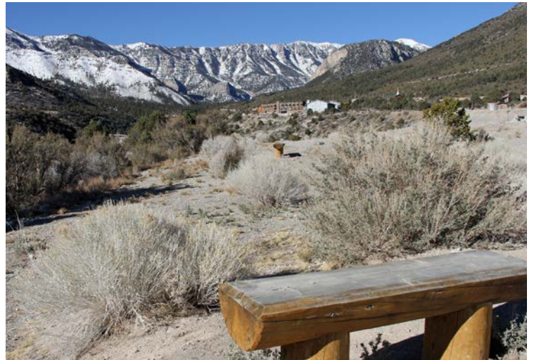
Looking west along Escarpment Trail towards the Retreat on Charleston Peak and the Spring Mountains.