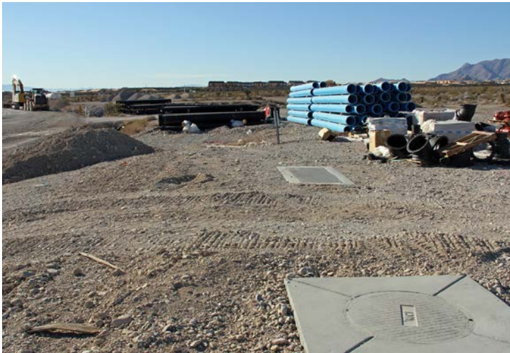
New water mains at Oso Blanca and Kyle Canyon Roads.