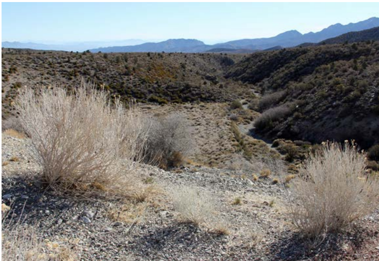
Looking east from Escarpment Trail towards Las Vegas.