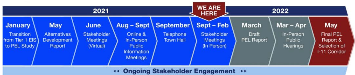
Fig. 1 I-11 Project Timeline (Nevada Department of Transportation 2021)