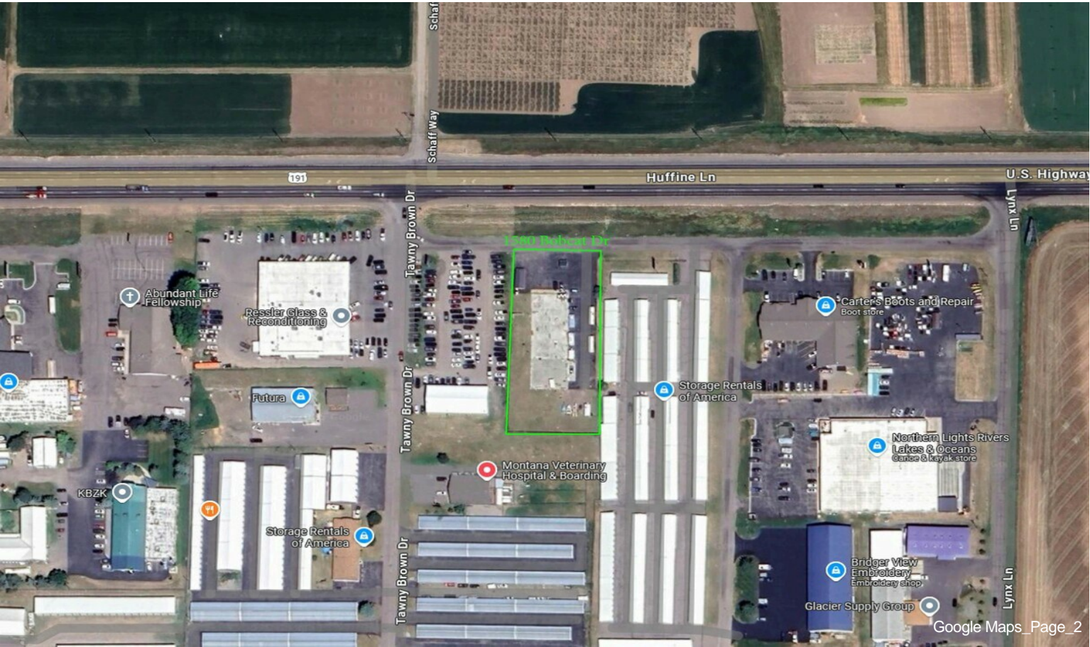
Google Maps Page 2