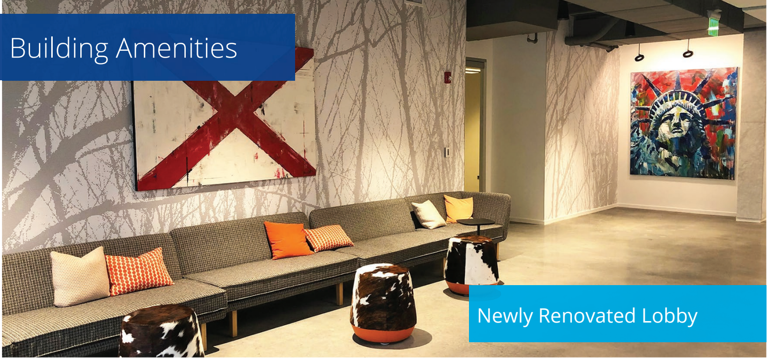
Newly Renovated Lobby