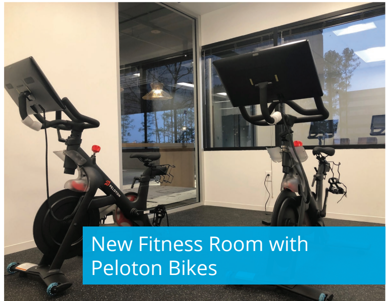
New Fitness Room with Peloton Bikes