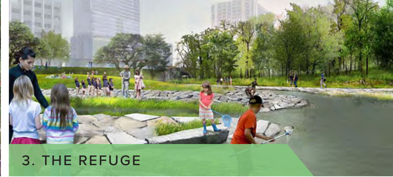
3. THE REFUGE