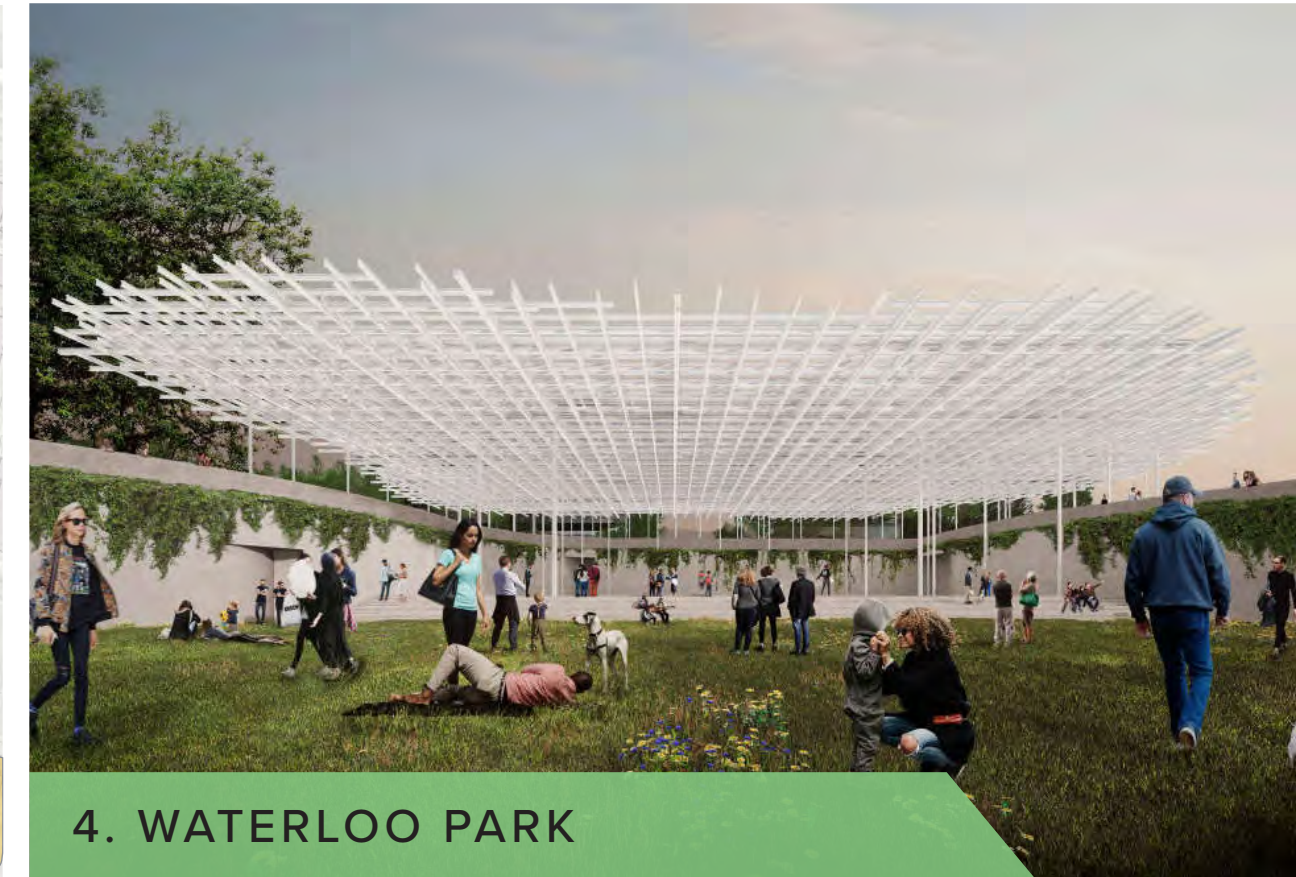
4. WATERLOO PARK