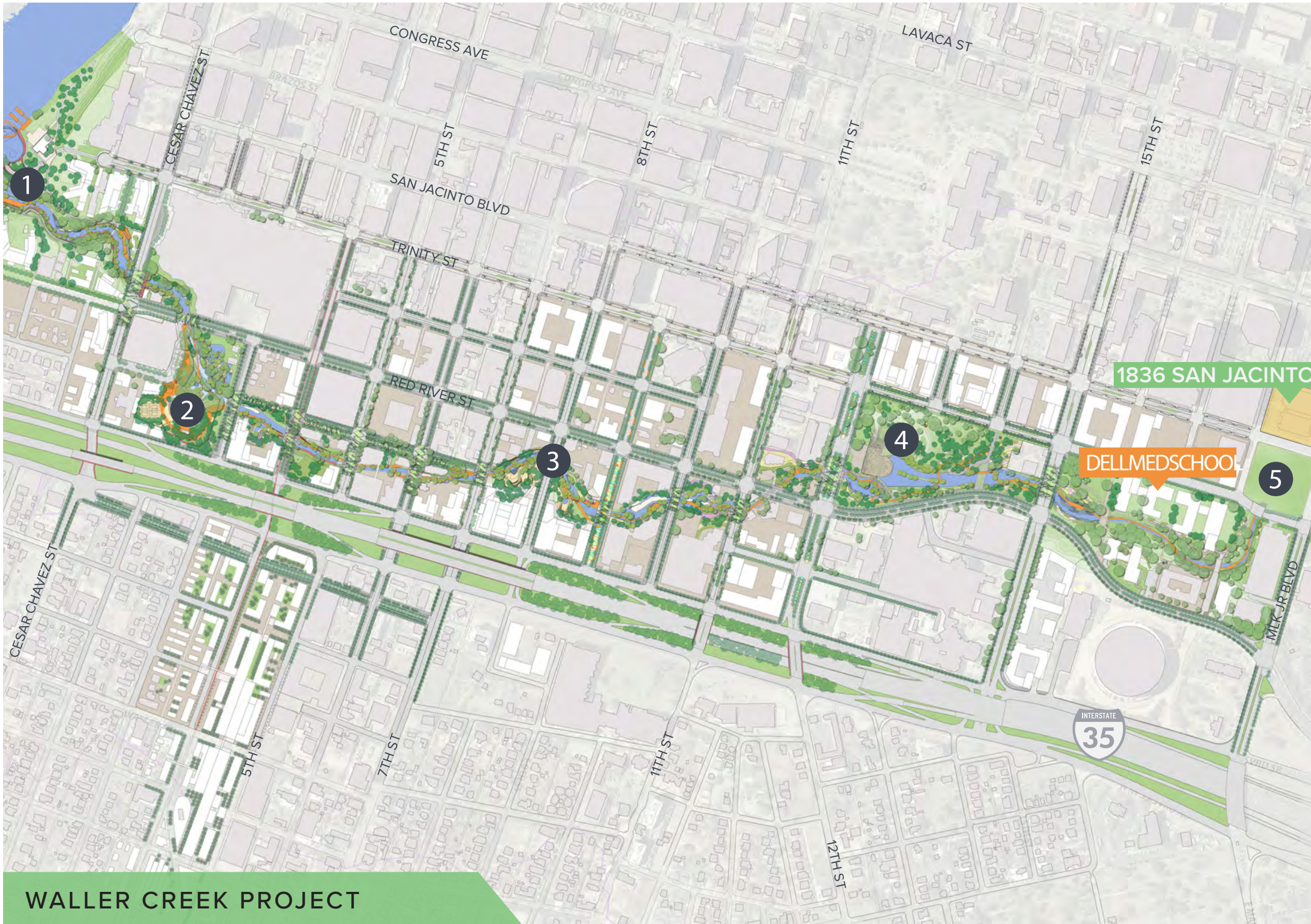
WALLER CREEK PROJECT