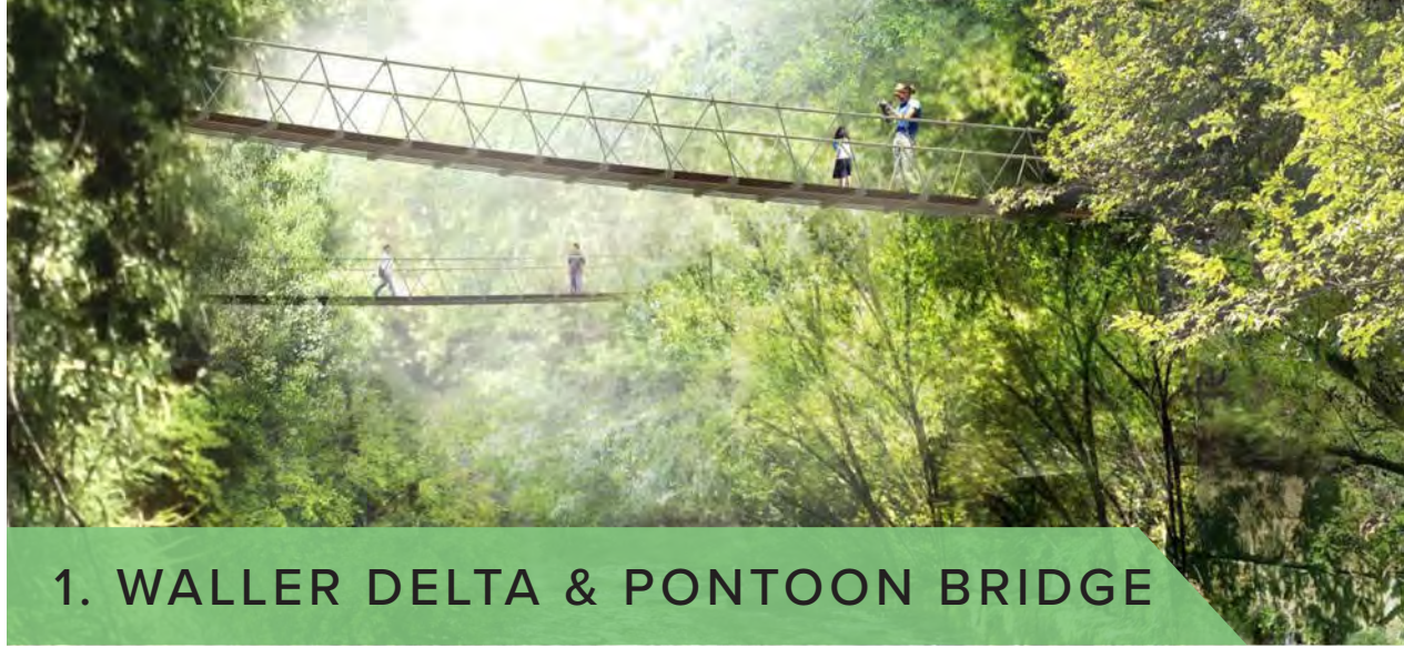
1. WALLER DELTA & PONTOON BRIDGE