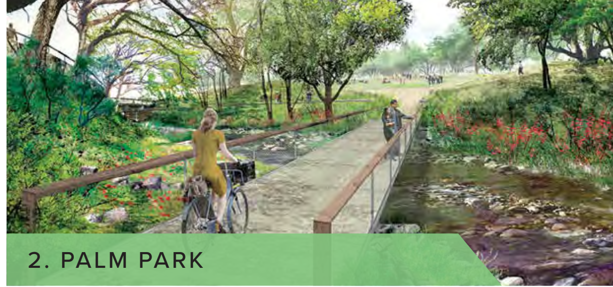
2. PALM PARK