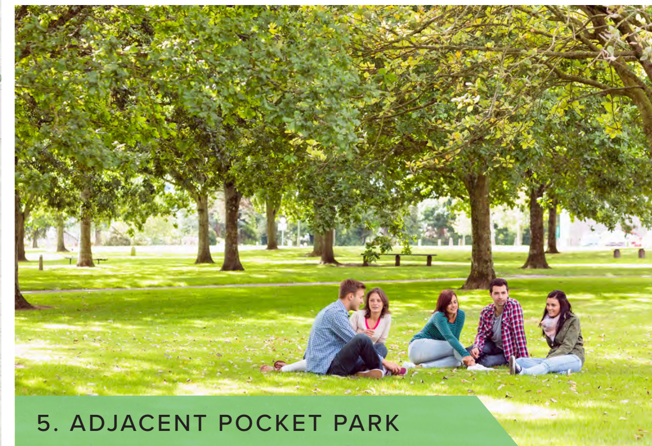
5. ADJACENT POCKET PARK