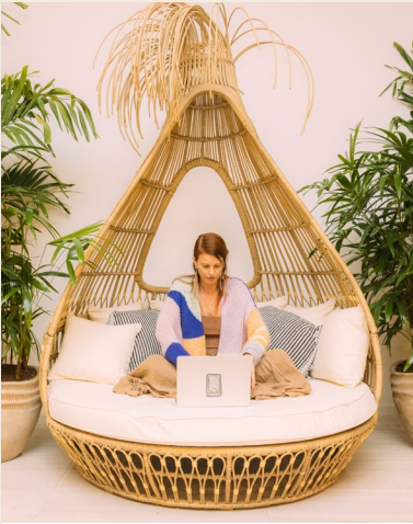
COMMON AREA LOUNGE