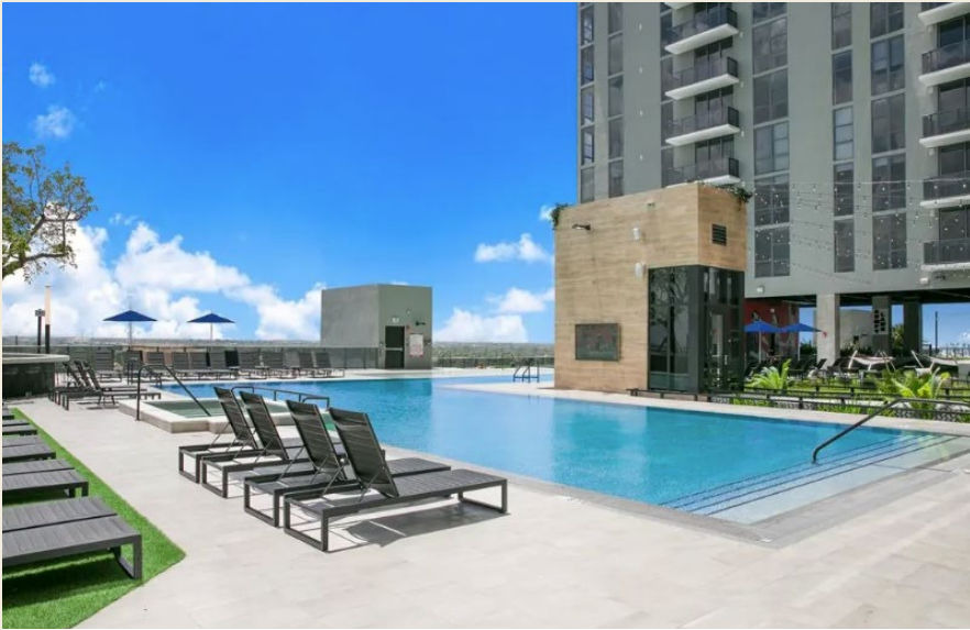
RESORT STYLE ROOF-TOP POOL DECK

Tenants of the FLOW offices get exclusive access to some of the coveted amenities offered on the property.