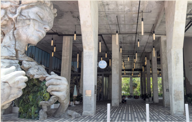
GRAND SENSE OF ARRIVAL — GROUND FLOOR