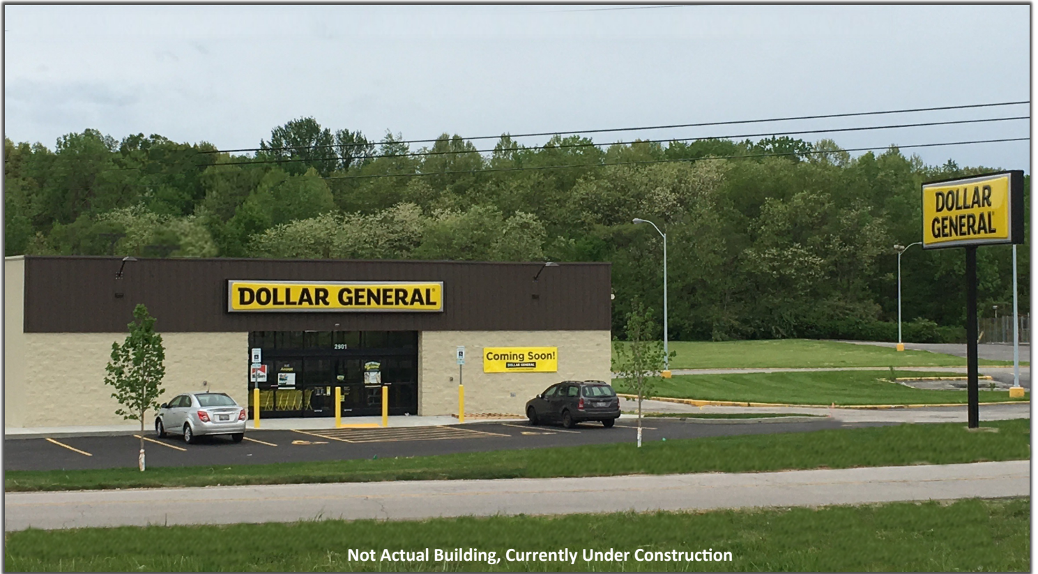
Not Actual Building, Currently Under Construction