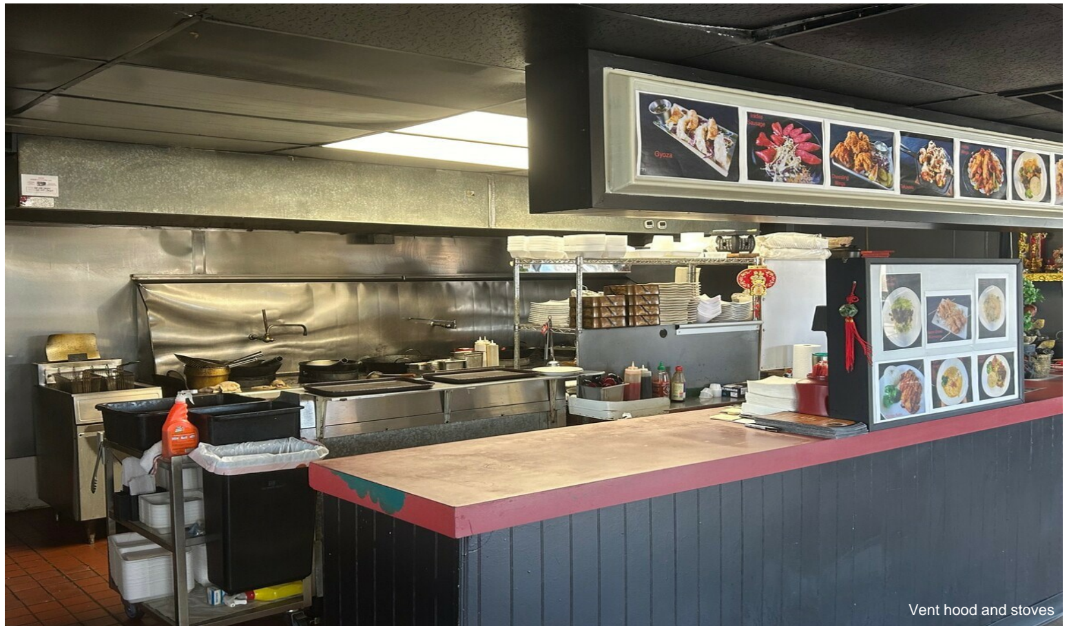
Vent hood and stoves