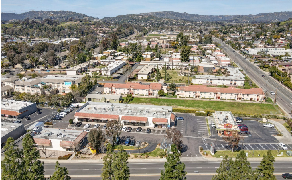
120-136 W El Norte Parkway, Escondido, CA 92026