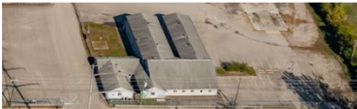
1630 Broadway aerial 14