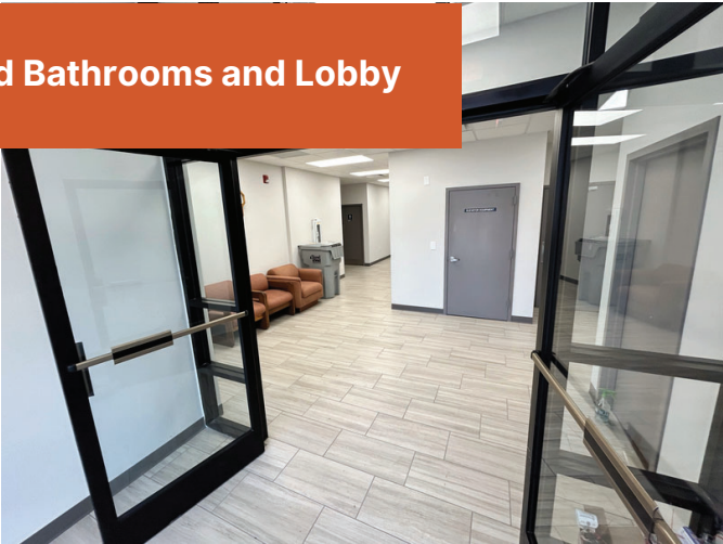
Renovated Bathrooms and Lobby

3916 SUNSET RIDGE ROAD SUITE 100 | RALEIGH NC