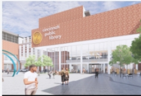
Public Library Renovation Major Renovation of Public Library