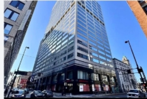
The Avant Office Conversion Project