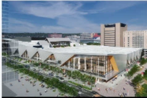
Convention Center Renovation Full Office Renovation