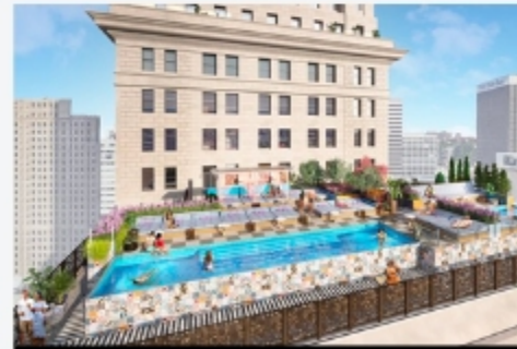
Sky Central Apartment Conversion from Office to Residential