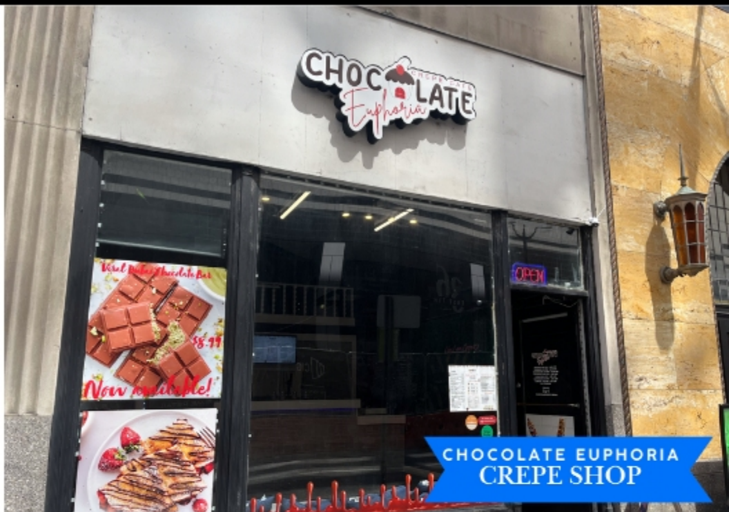
CHOCOLATE EUPHORIA CREPE SHOP