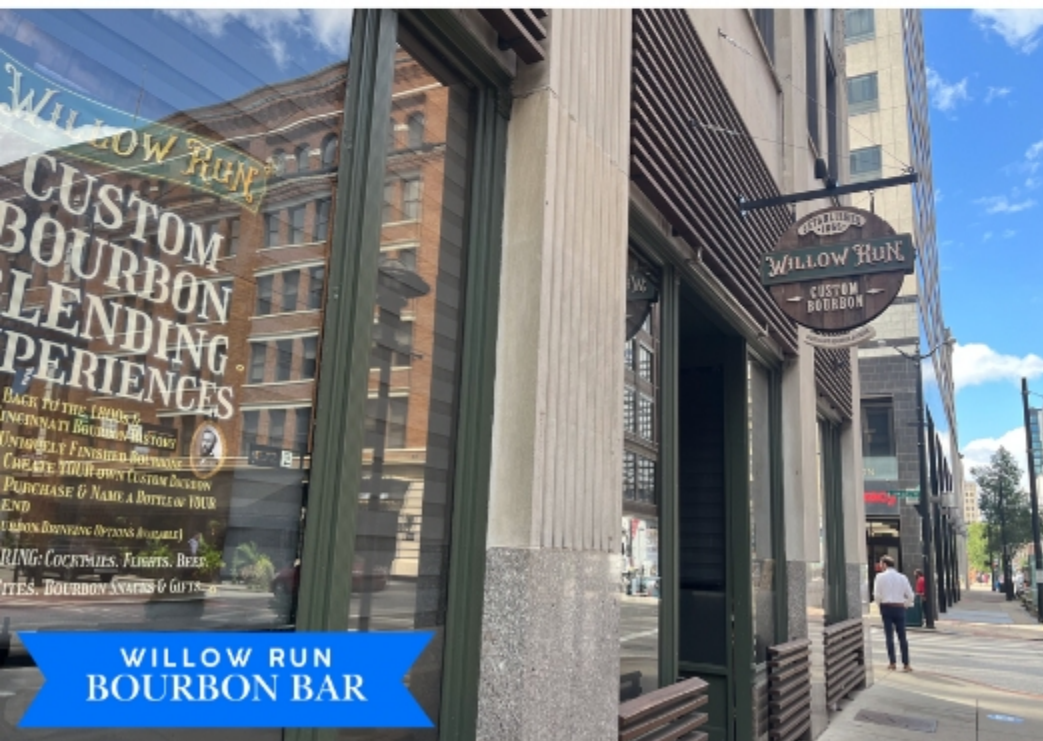
WILLOW RUN BOURBON BAR