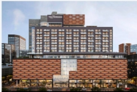
Moxy of Cincinnati New 111-Unit Hotel