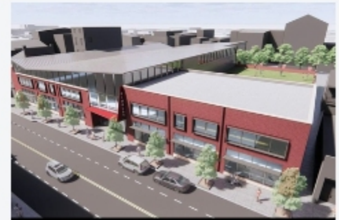
$61M OTR Project Findlay Community Center & Crossroads Health