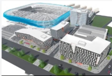
FC Cincinnati Mixed-Use District Mixed-Use Development