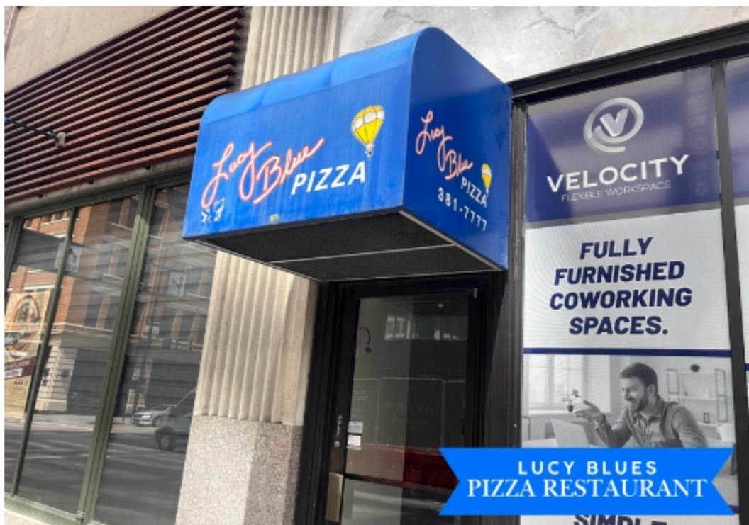
LUCY BLUES PIZZA RESTAURANT