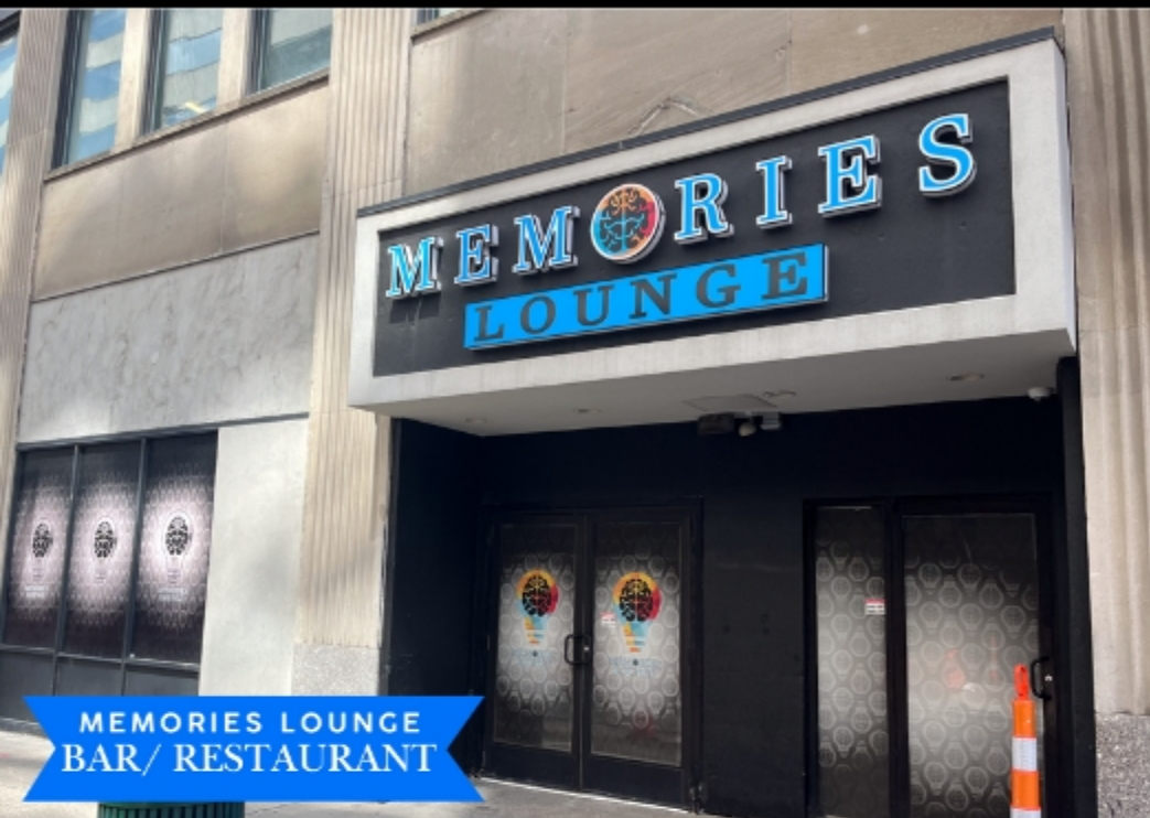
MEMORIES LOUNGE BAR/ RESTAURANT