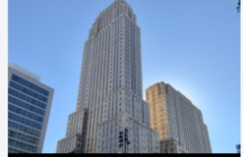
Carew Tower Transformation Mixed-Use Development