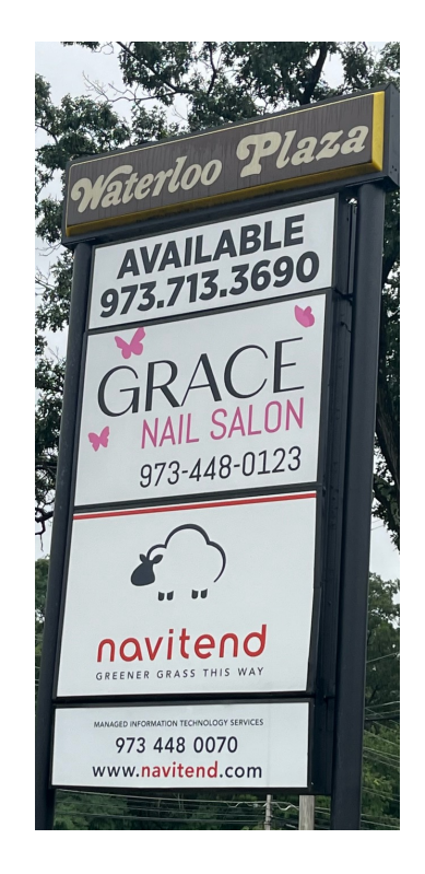
23 US Highway 206