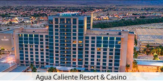
Agua Caliente Resort & Casino

SIGNATURE FIRST PHASE OF SECTION 19 SPECIFIC PLAN PRIME MIXED-USE DEVELOPMENT OPPORTUNITY RANCHO MIRAGE, CA | COACHELLA VALLEY | RIVERSIDE COUNTY