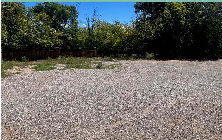
Large Fenced & Secured Yard