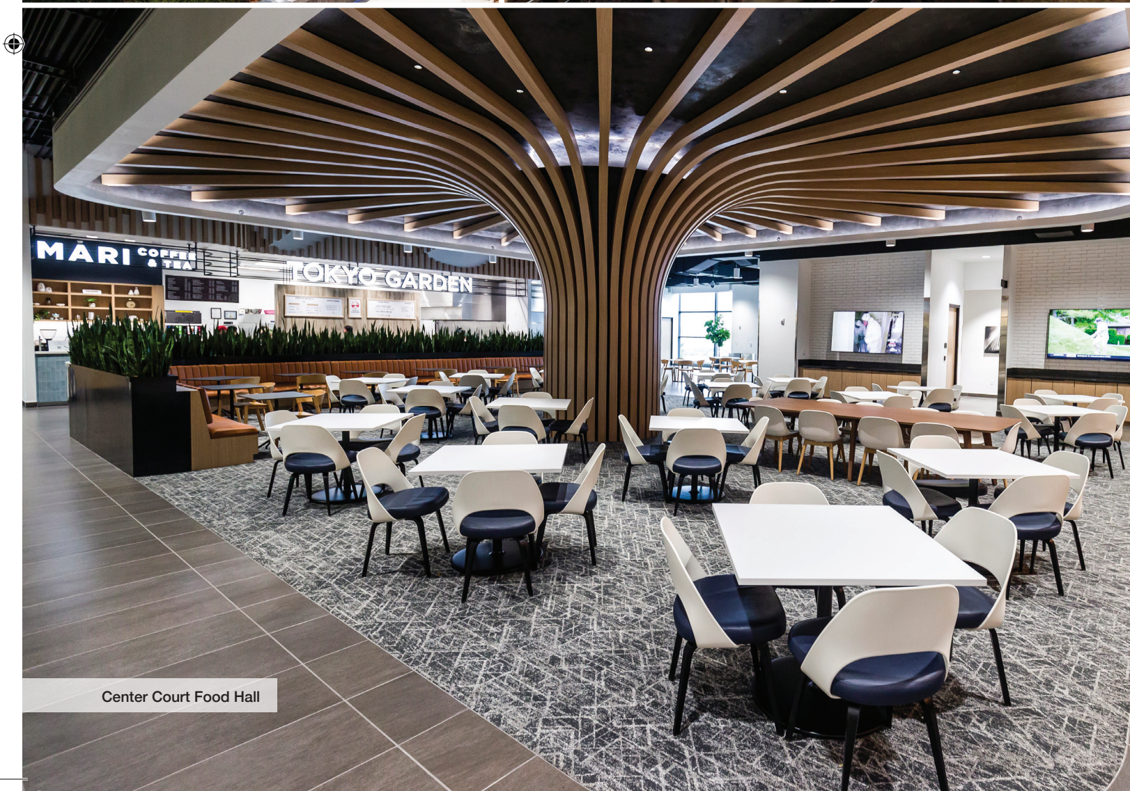
Center Court Food Hall

Tulsa is a dynamic city committed to being a desirable community in which to live, work and play. For more information about Tulsa, please visit www.cityoftulsa.org or www.tulsachamber.com .