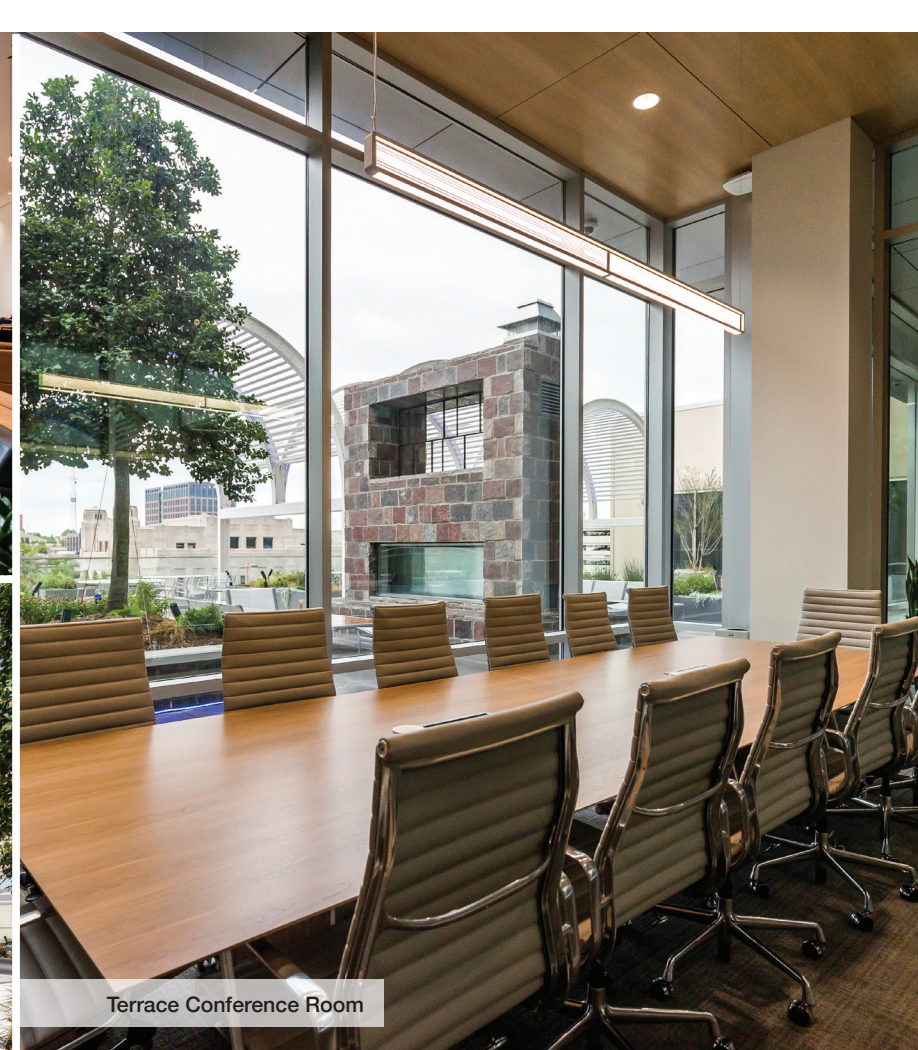
Terrace Conference Room