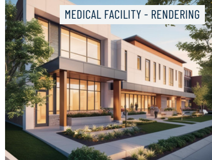
MEDICAL FACILITY - RENDERING