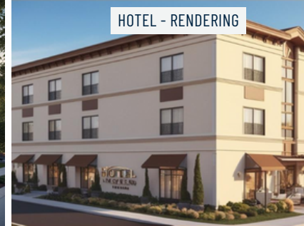
HOTEL - RENDERING