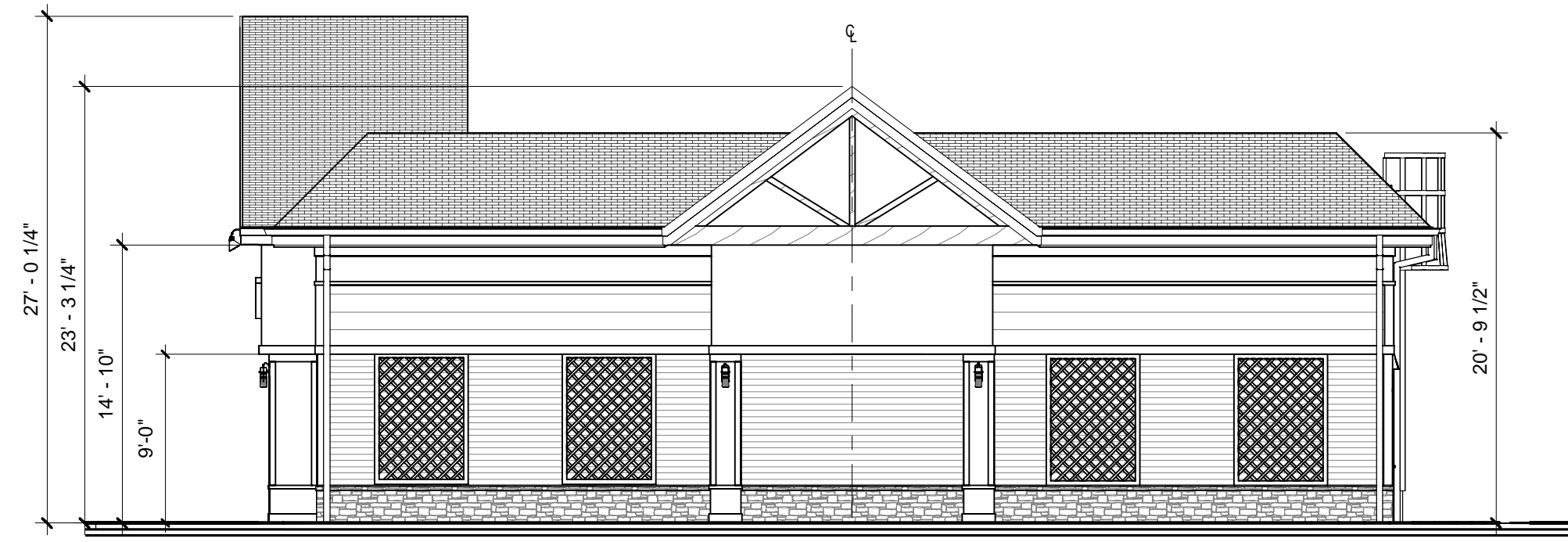
3 SIDE ELEVATION SCALE: 1/8" = 1'-0"