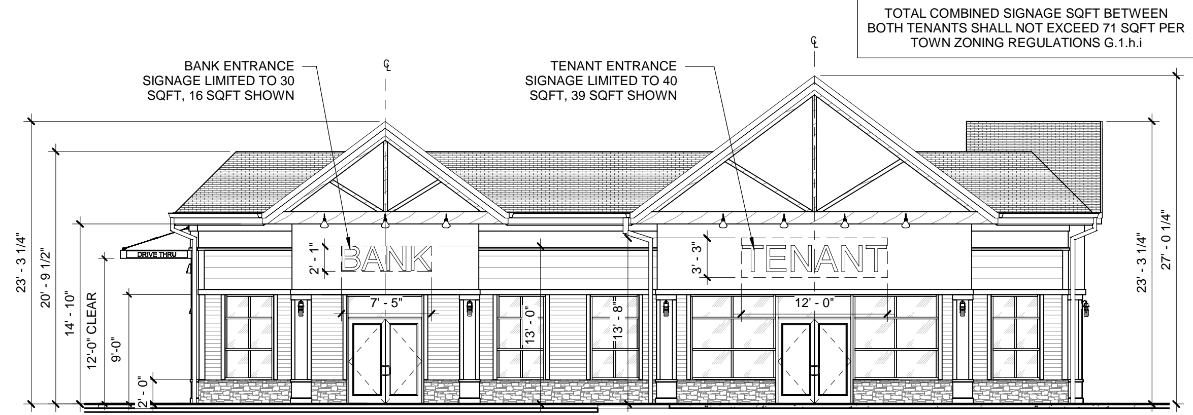
2 FRONT ELEVATION SCALE: 1/8" = 1'-0"