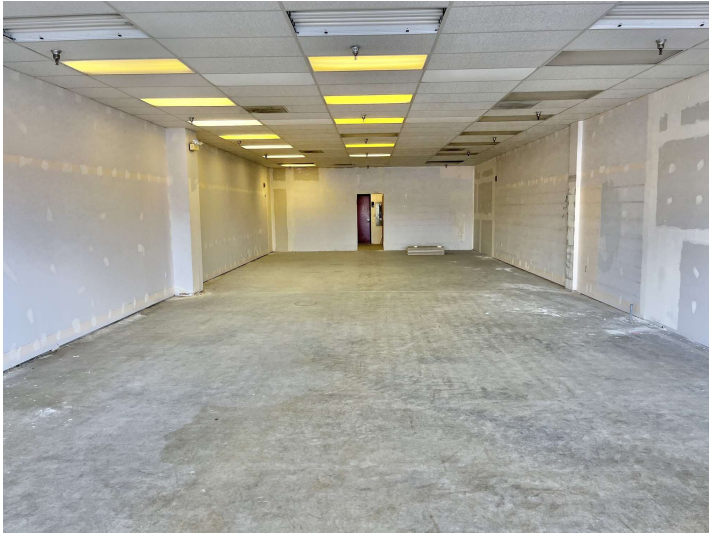
Suite 1A: 2,000 SF