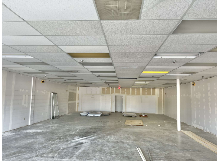
Suite 1B: 2,800 SF