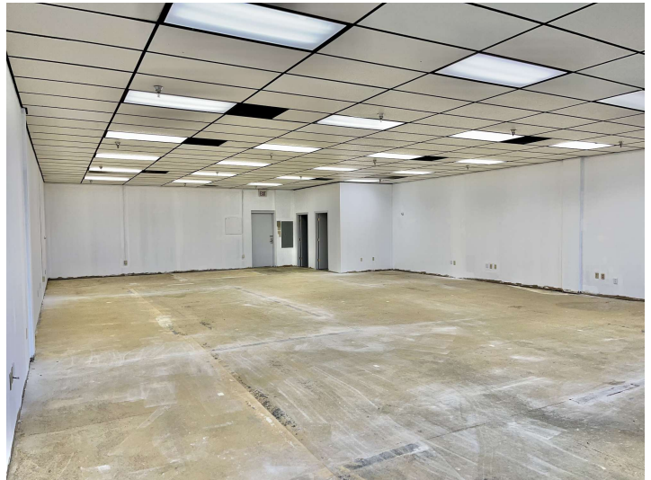
Suite 14: 2,100 SF

ALEX REED Broker 574.306.0790 areed@bradleyco.com