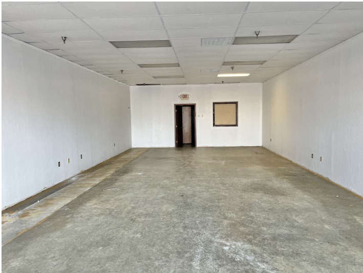
Suite 3: 1,300 SF