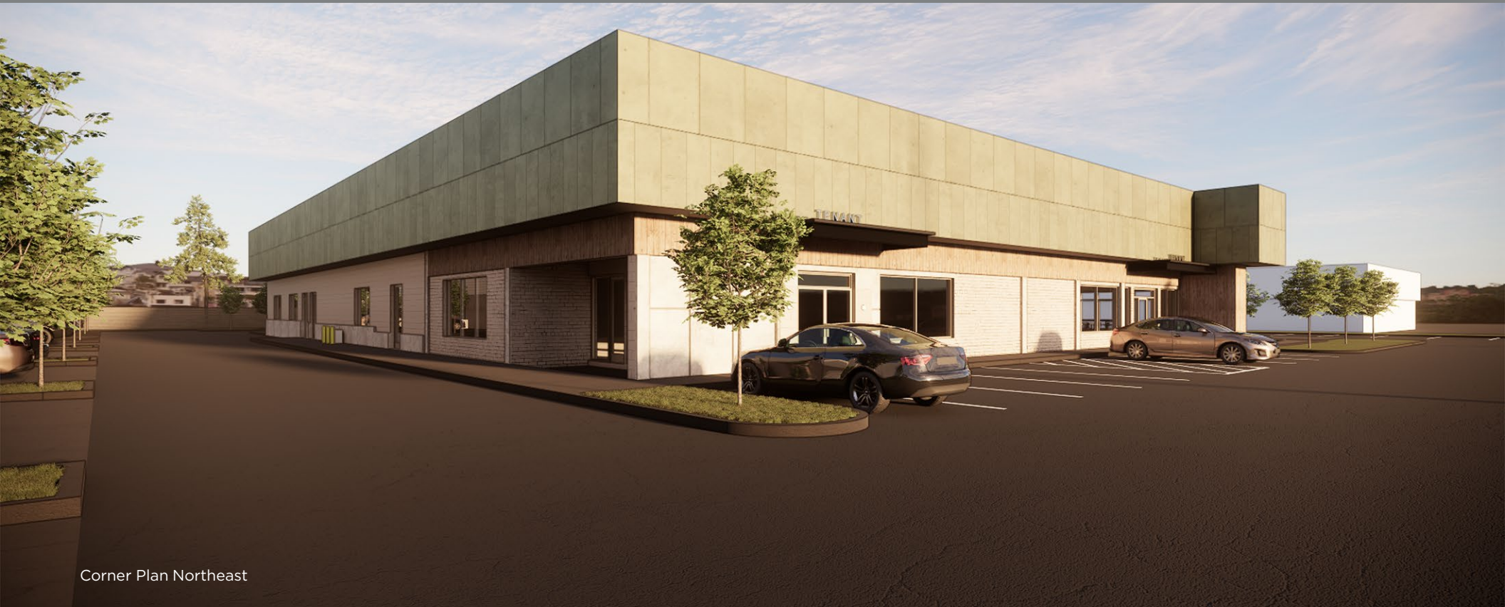
Corner Plan Northeast

For Lease | Retail/Office | ±10,386 SF Available