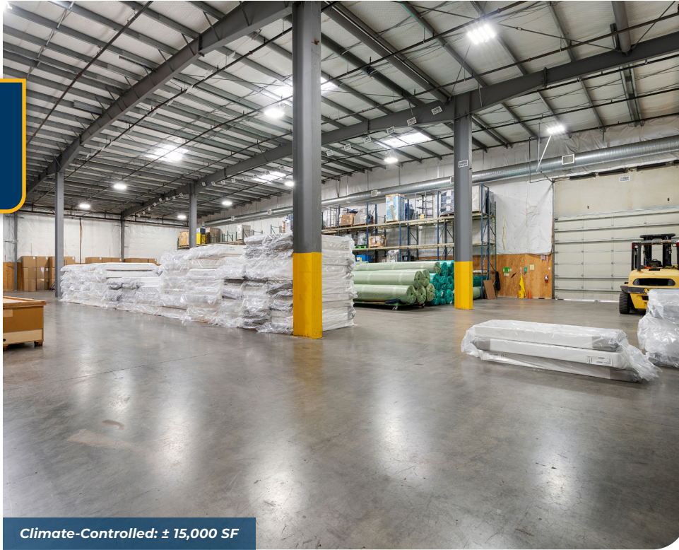
Climate-Controlled: \pm 15,000 SF