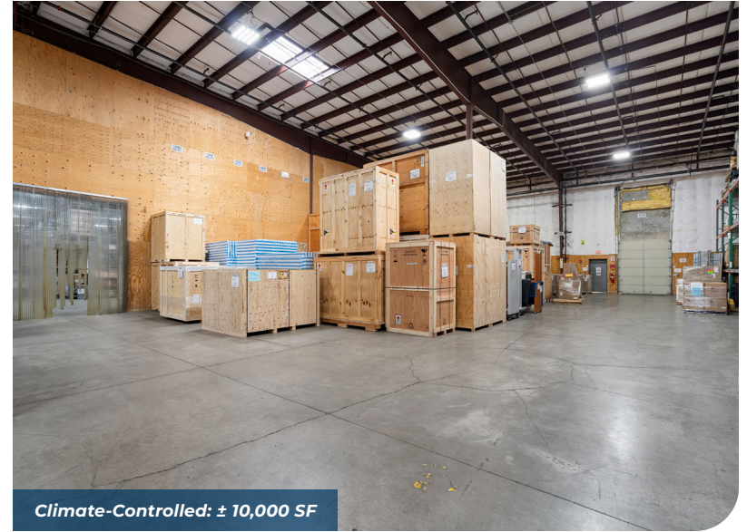
Climate-Controlled: \pm 10,000 SF