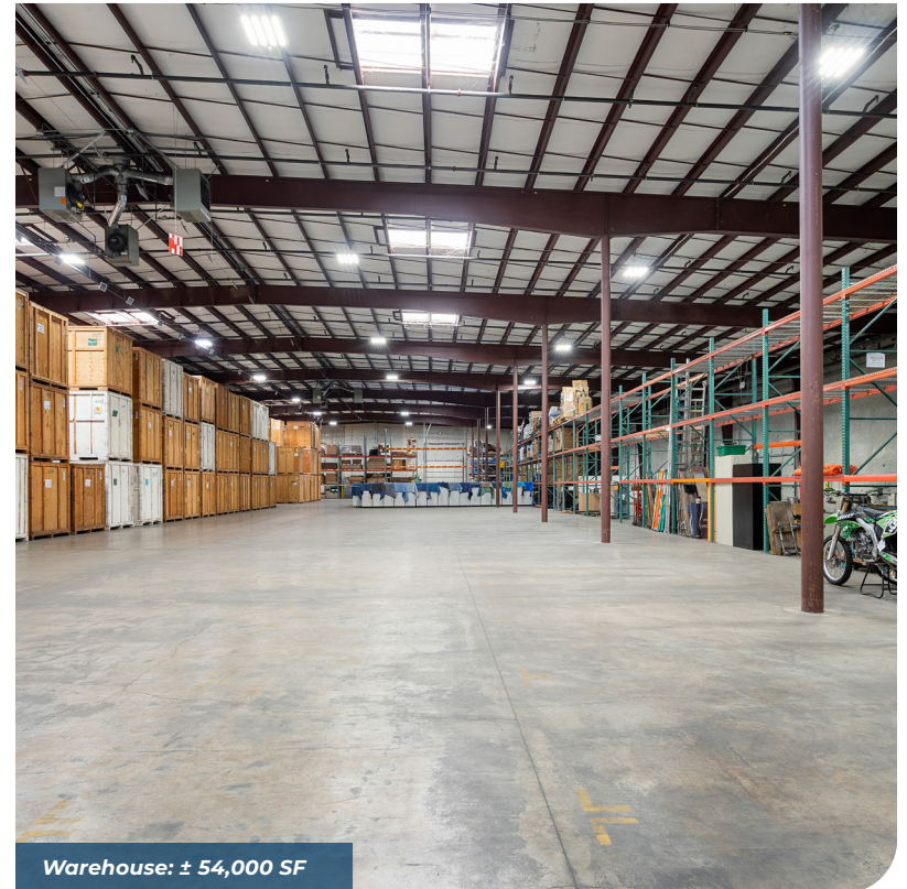
Warehouse: \pm 54,000 SF