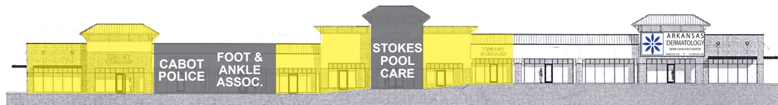
2 EAST ELEVATION 1/32" = 1'-0"