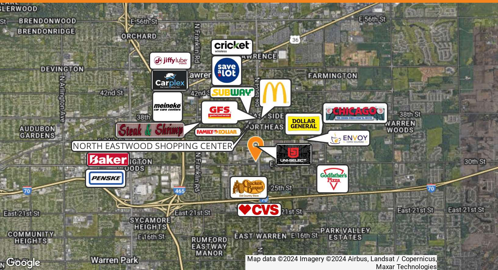
Map data ©2024 Imagery ©2024 Airbus, Landsat / Copernicus, Maxar Technologies