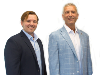
THE A.R.E.A. TEAM