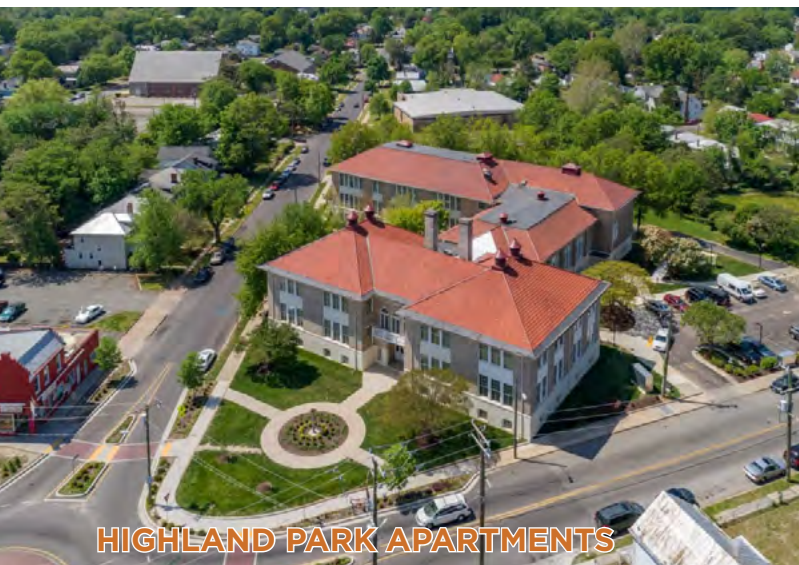
HIGHLAND PARK APARTMENTS

Green Park Apartments is a brand-new, energy-efficient community offering spacious 1-, 2-, and 3-bedroom apartments, thoughtfully crafted with stylish finishes and contemporary features. Nestled in a walkable neighborhood with easy access to public transportation, shopping, dining, and parks, Green Park Apartments puts tenants right where they want to be. Plus, with dedicated parking, on-site management, and a comprehensive security system , tenants feel peace of mind every day.