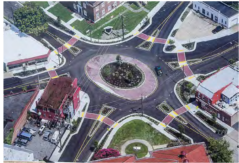
SIX POINTS INTERSECTION

Green Park Apartments is the third project in the immediate proximity by non-profit developer Enterprise Community Development (ECD). Other communities include Highland Park Senior Apartments (77 units, immediately adjacent), and Highland Terrace (66 units, directly across the street). ECD is a mission-driven organization that specializes in high-impact residential development, preservation, property management and resident services.