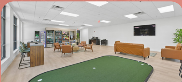
Tenant Lounge with Grab & Go Food