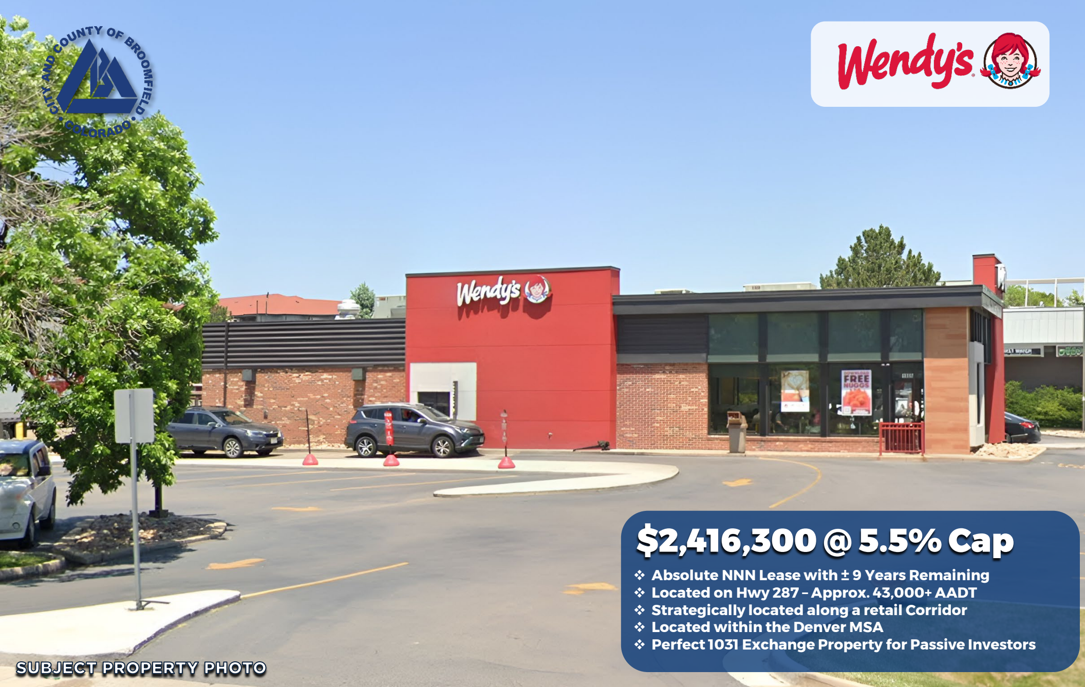
SUBJECT PROPERTY PHOTO