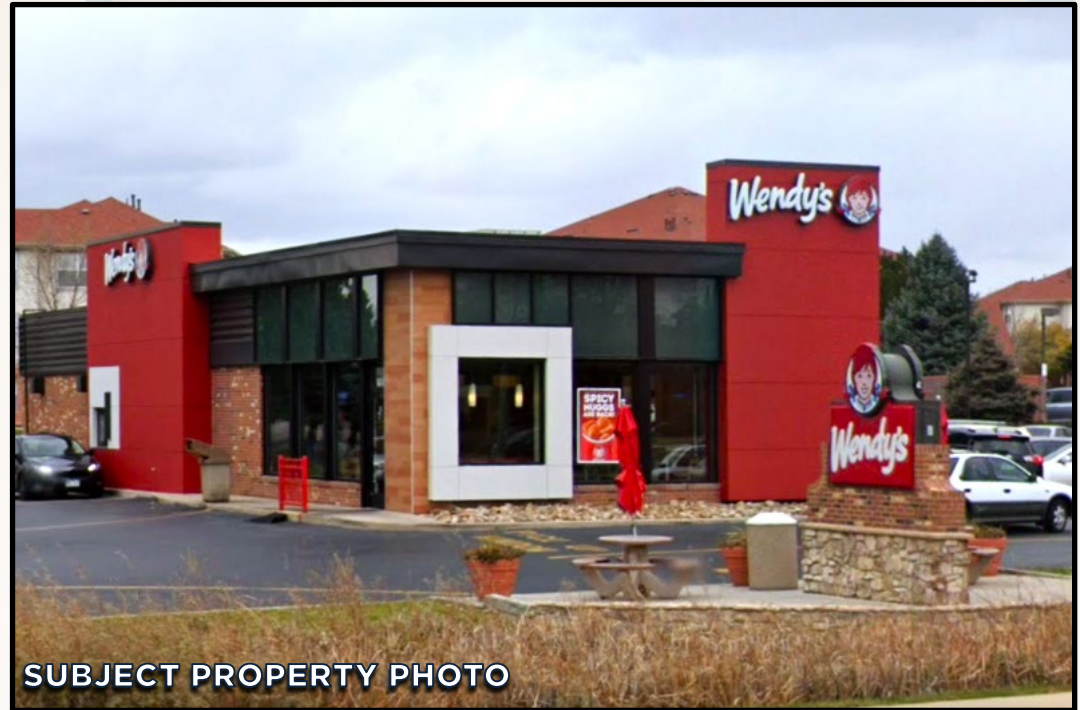
SUBJECT PROPERTY PHOTO