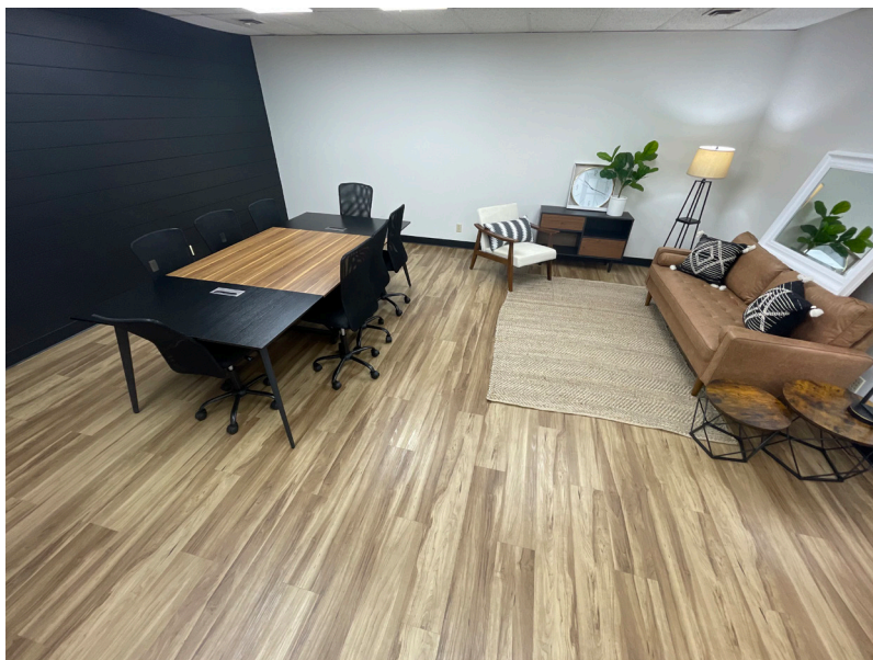
Common Conference Room