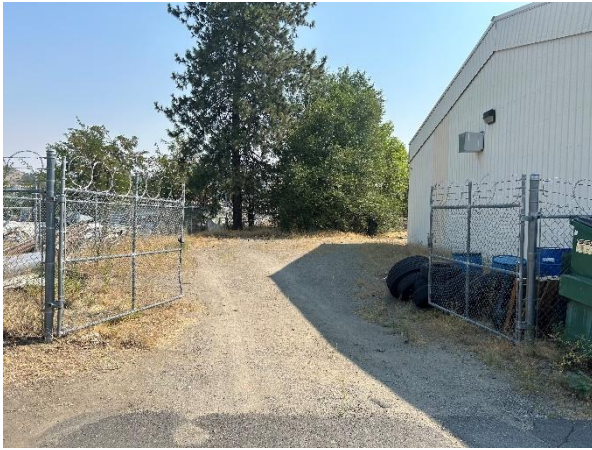
Side Yard - Gate

Levi McCormick W: 509.868.2125 levi@sdsrealty.com