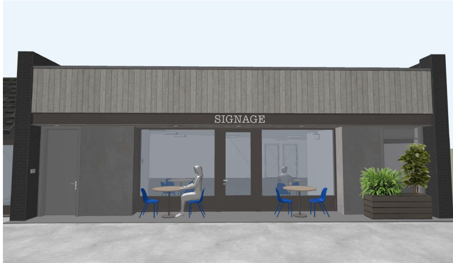
Entrance on Oak Street