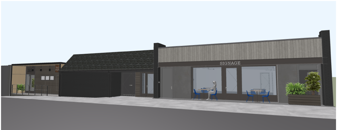
Entrance on Oak Street