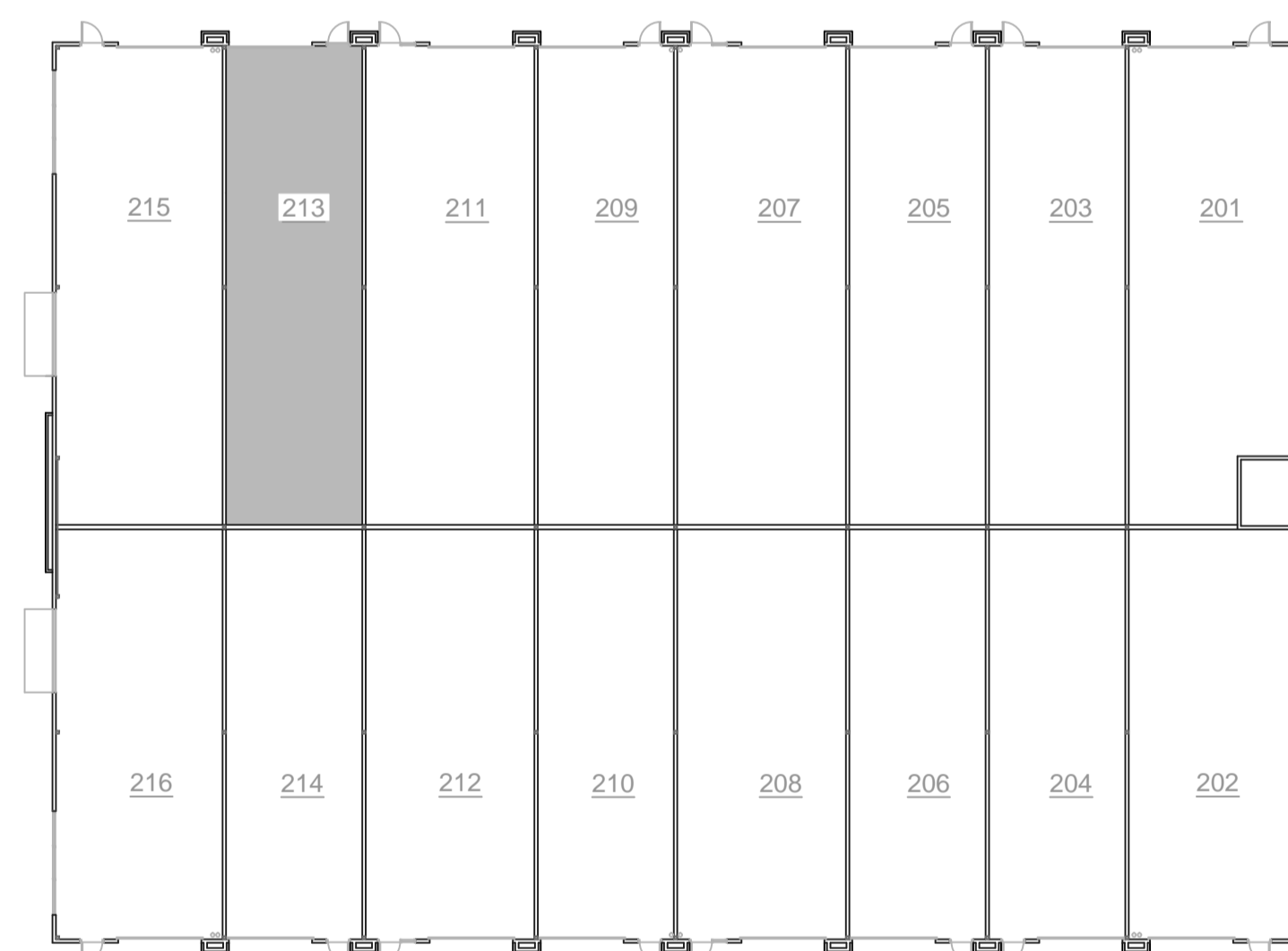
Building 2 - Suite Location Plan N.T.S.