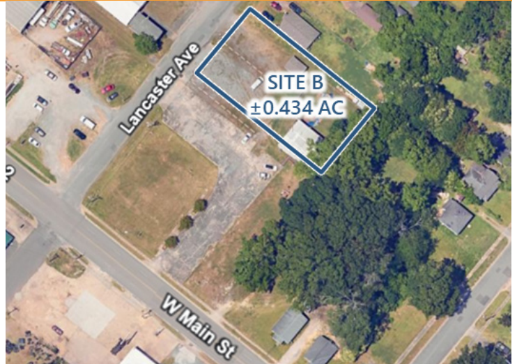
SITE B - $285,000