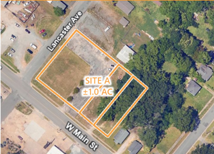
SITE A - $410,000