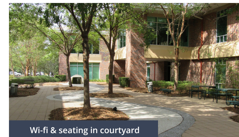
Wi-fi & seating in courtyard