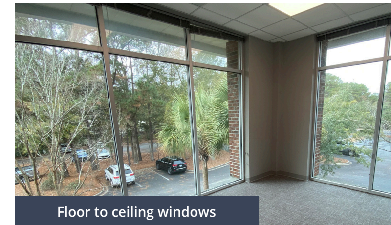
Floor to ceiling windows