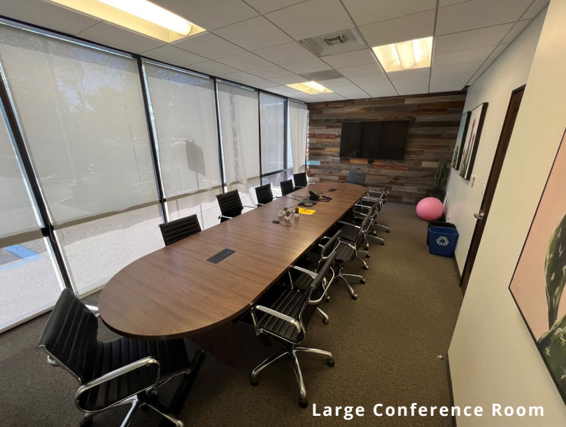
Large Conference Room