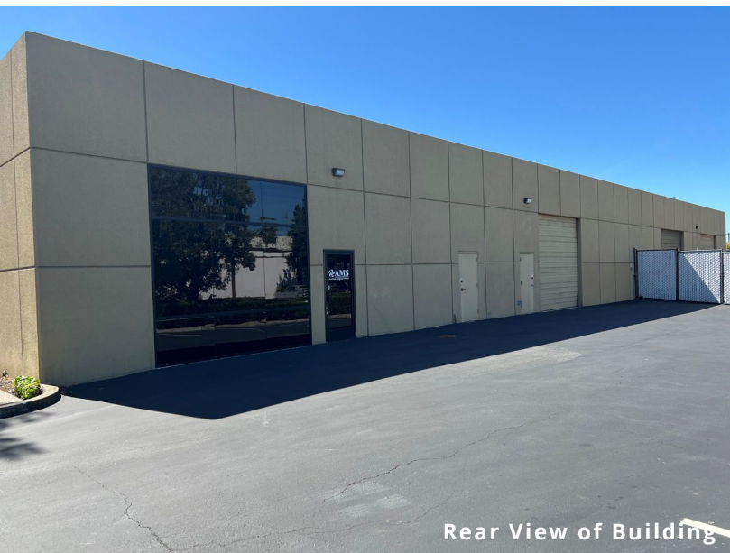
Rear View of Building