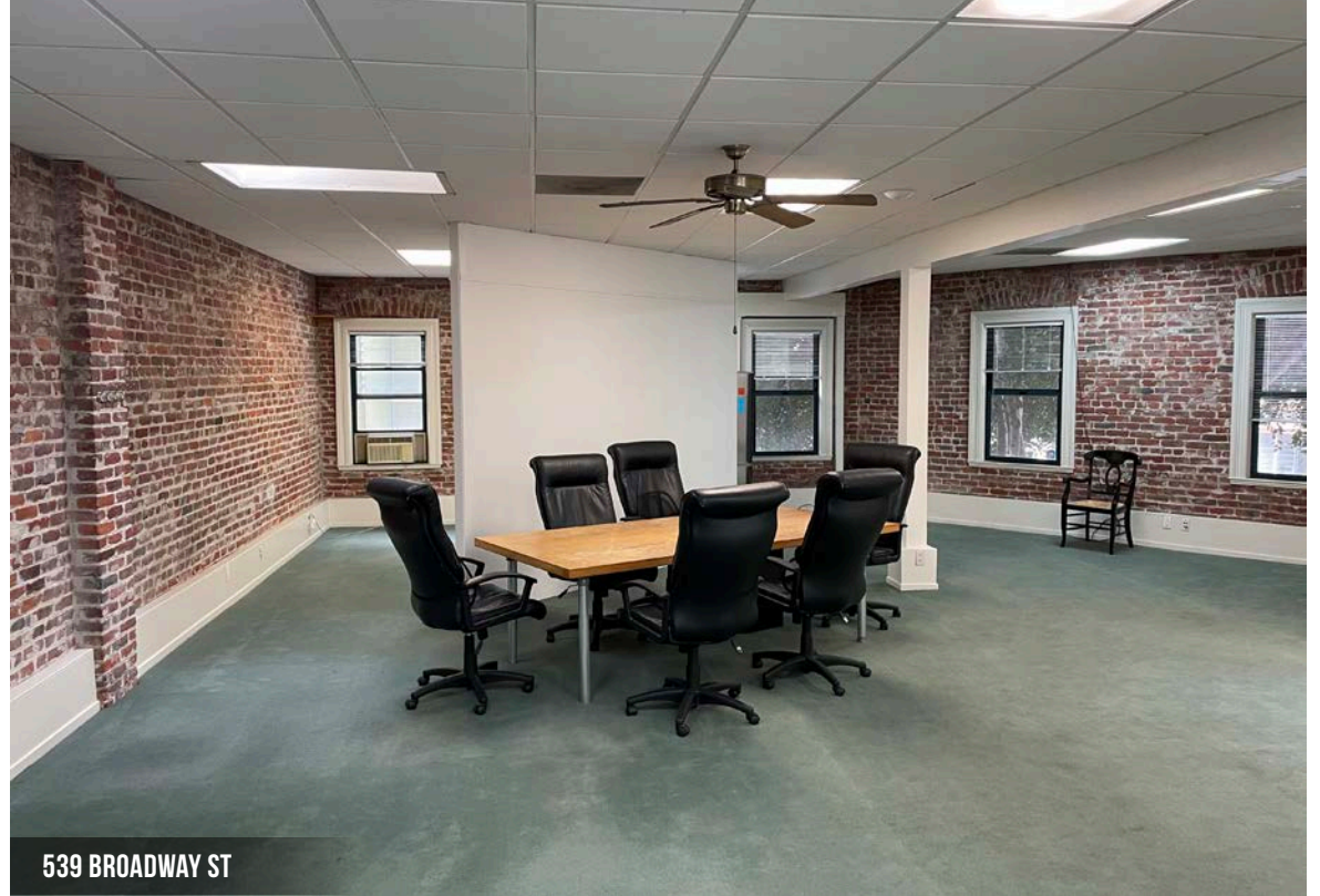
539 BROADWAY ST