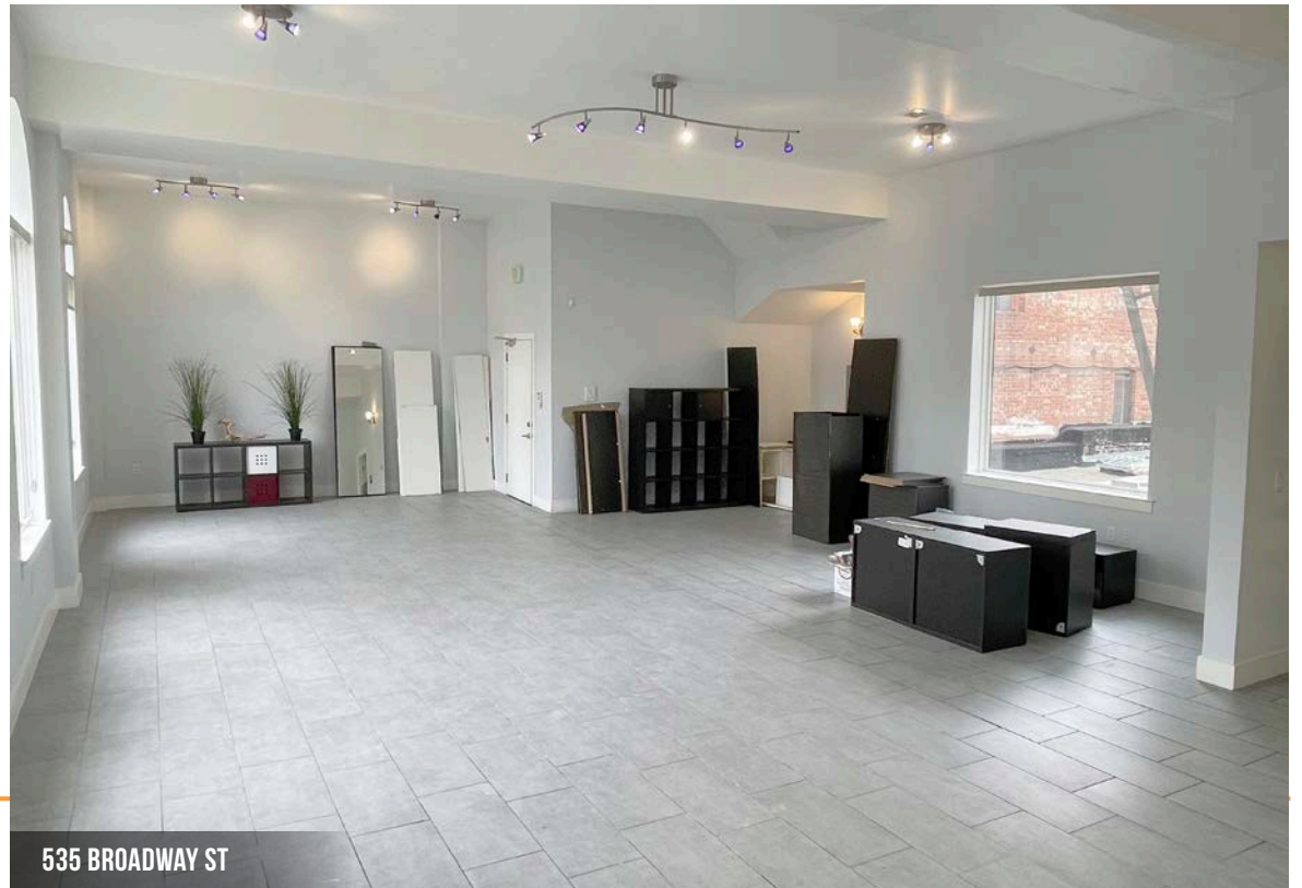
535 BROADWAY ST